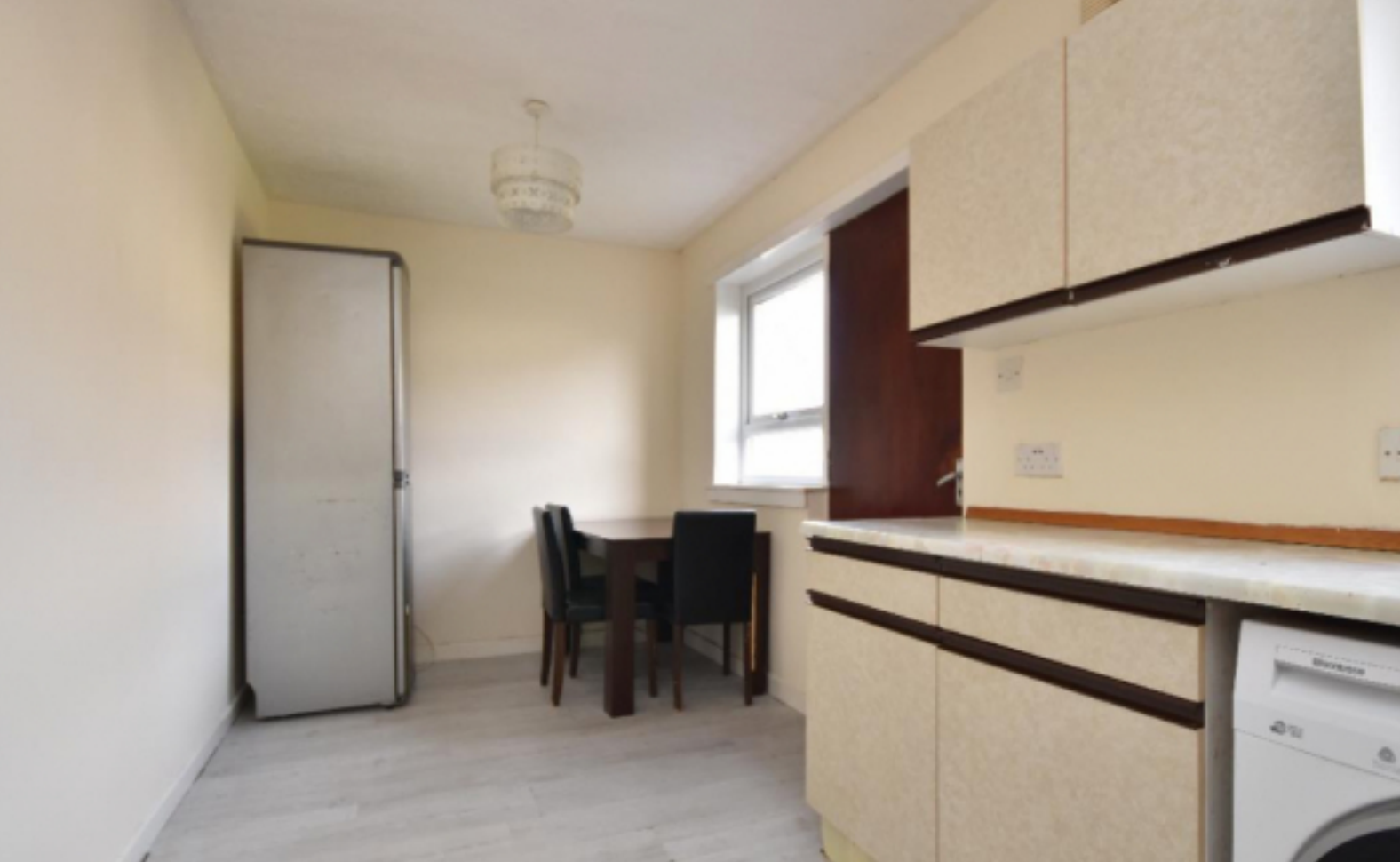
KITCHEN ALTERNATIVE VIEW