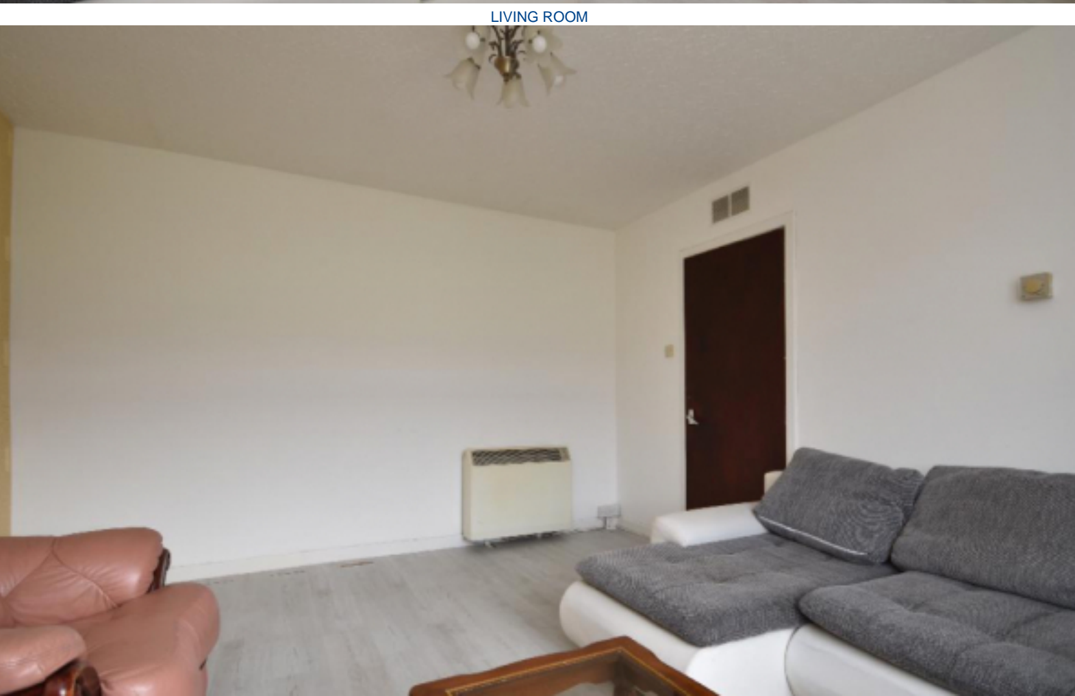
LIVING ROOM ALTERNATIVE VIEW