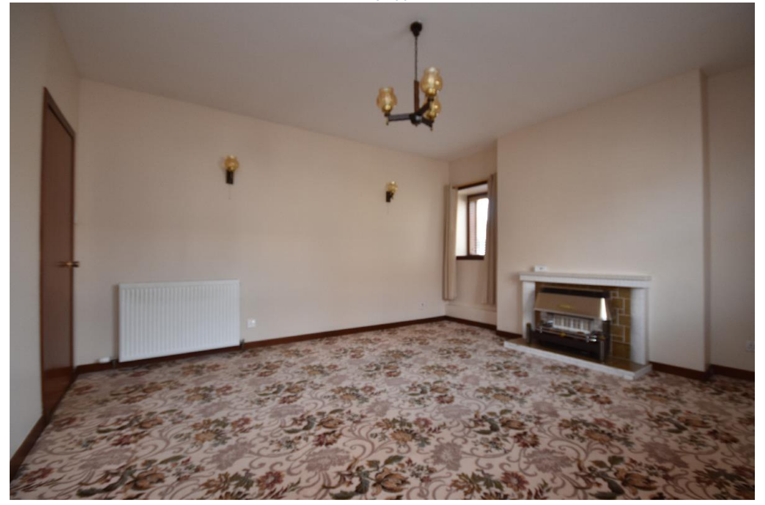
LIVING ROOM ALTERNATIVE VIEW