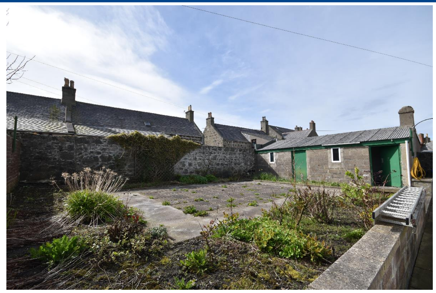
REAR GARDEN ALTERNATIVE VIEW