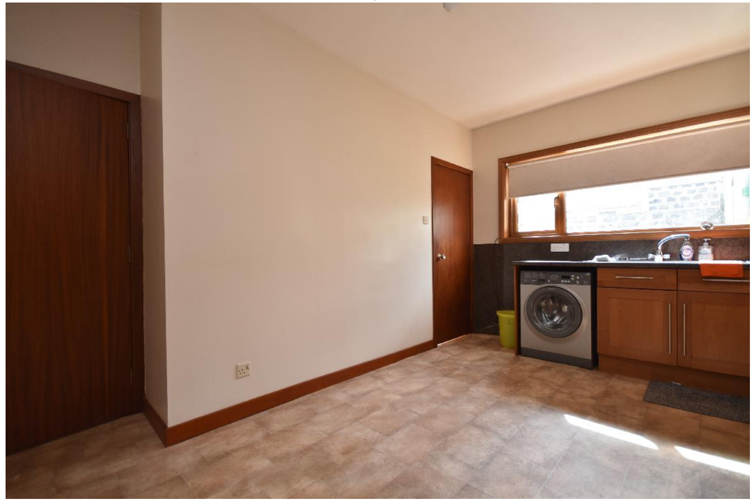
KITCHEN ALTERNATIVE VIEW