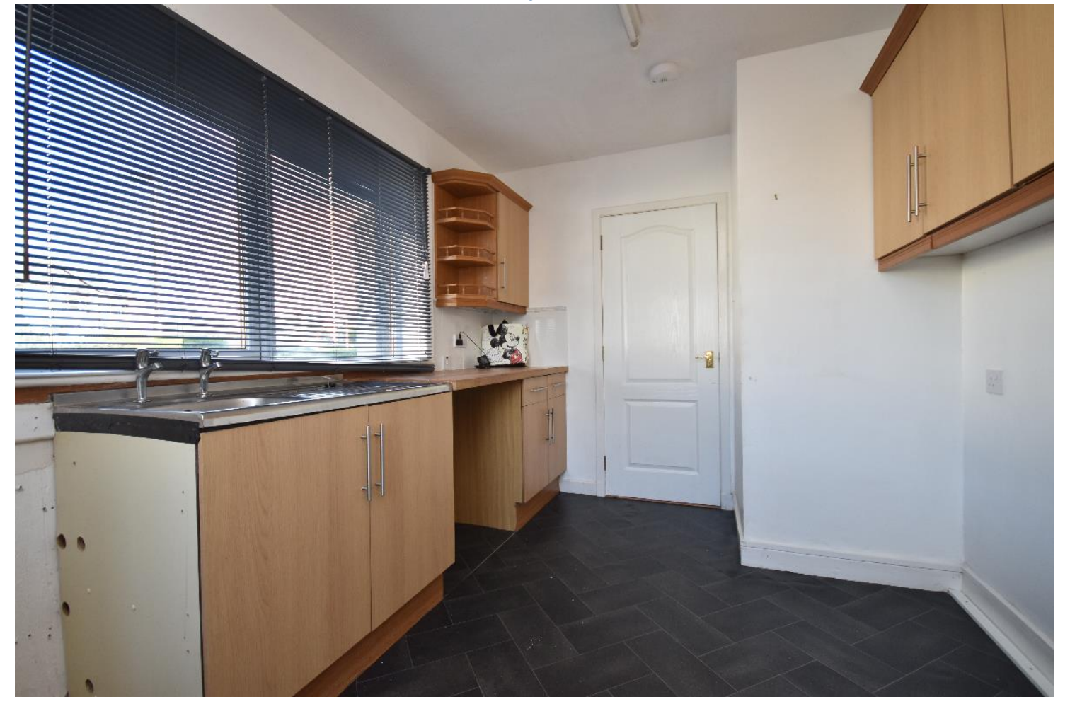
KITCHEN ALTERNATIVE VIEW