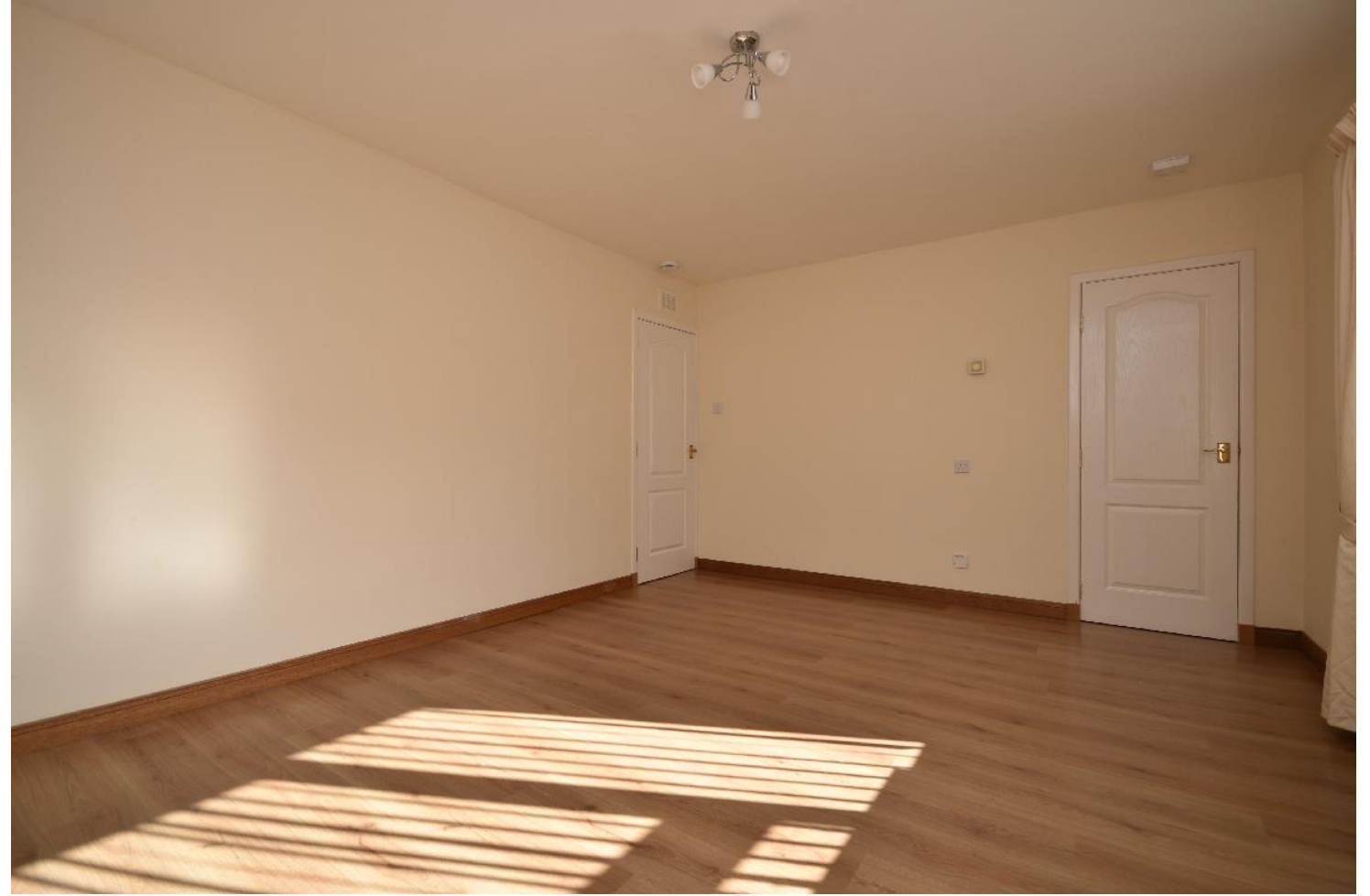
LIVING ROOM ALTERNATIVE VIEW