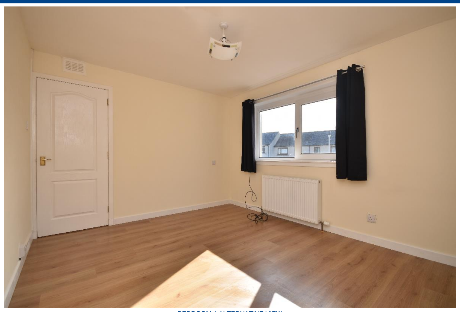
BEDROOM 1 ALTERNATIVE VIEW