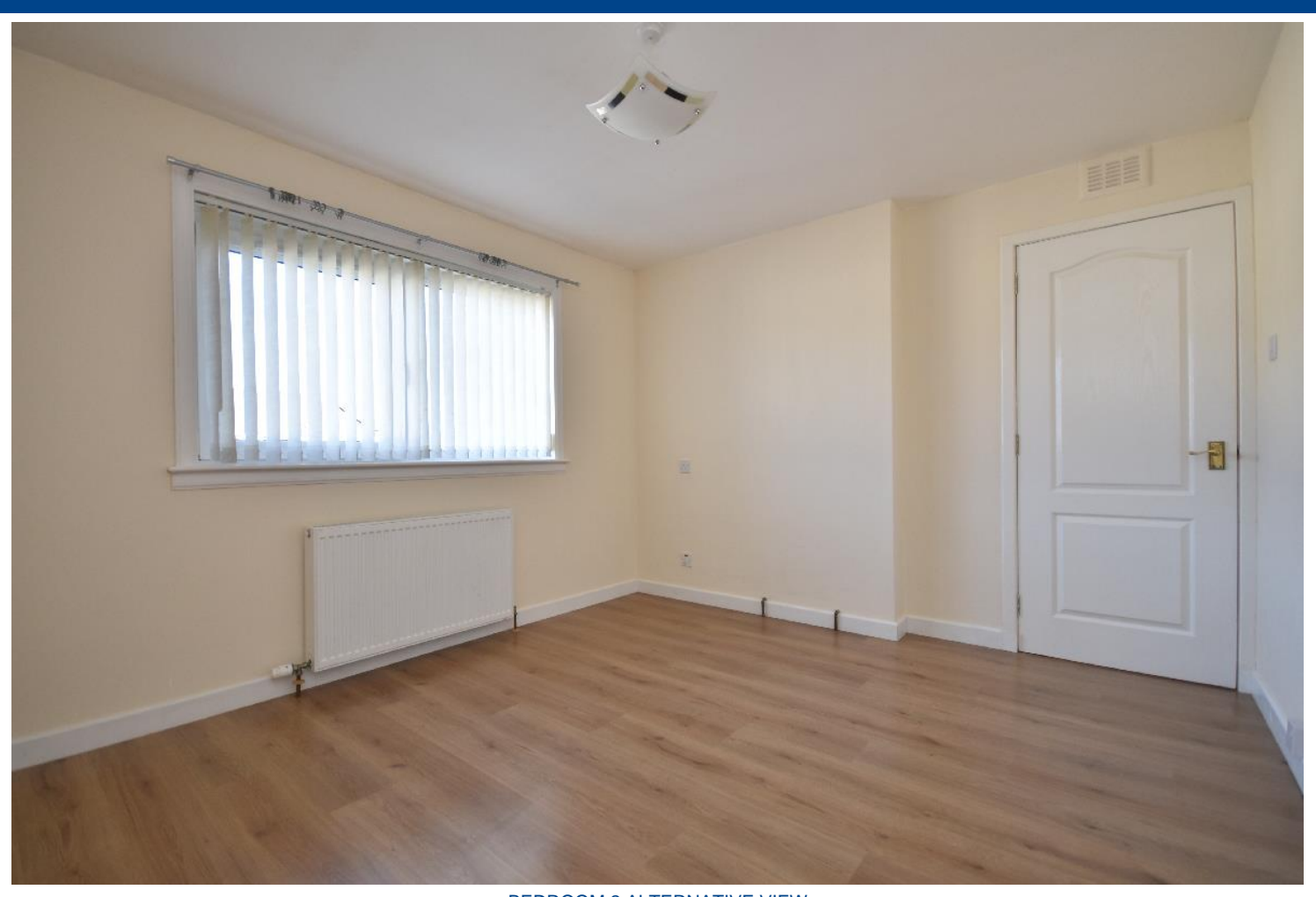
BEDROOM 2 ALTERNATIVE VIEW