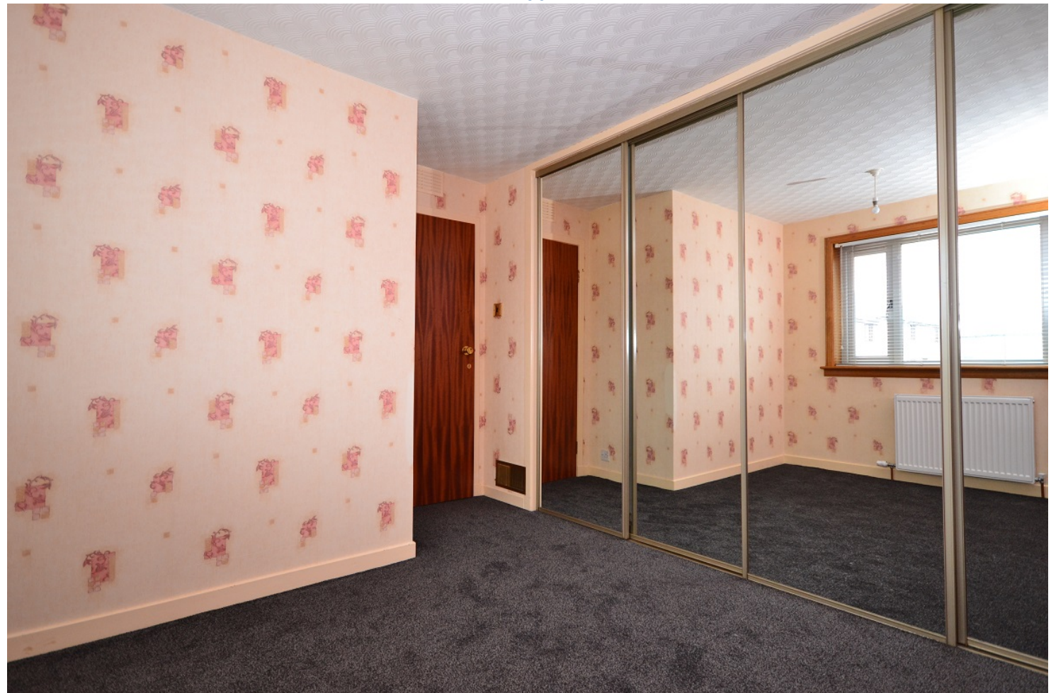
BEDROOM 1 ALTERNATIVE VIEW