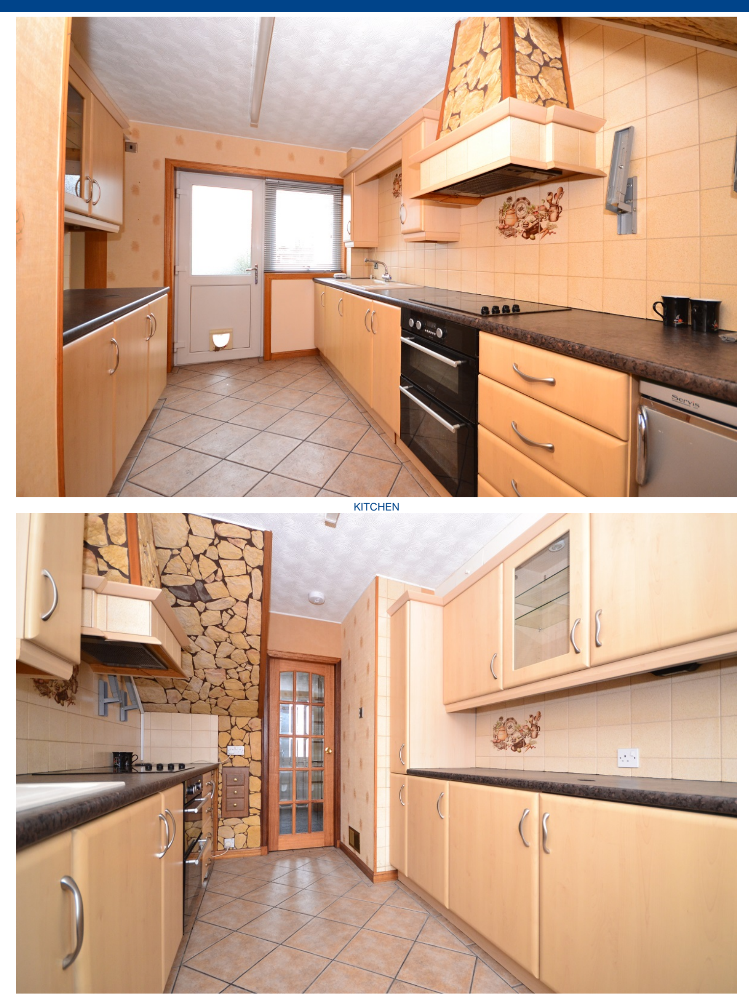
KITCHEN ALTERNATIVE VIEW