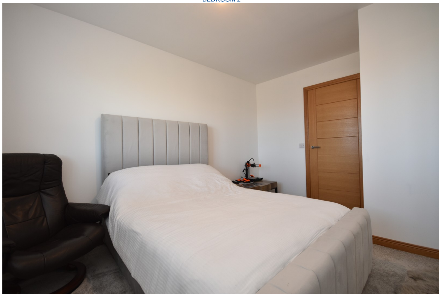
BEDROOM 2 ALTERNATIVE VIEW