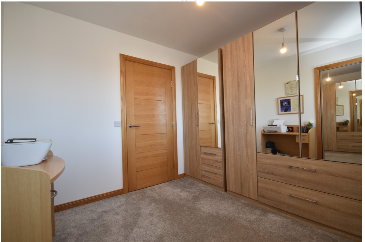
BEDROOM 3 ALTERNATIVE VIEW