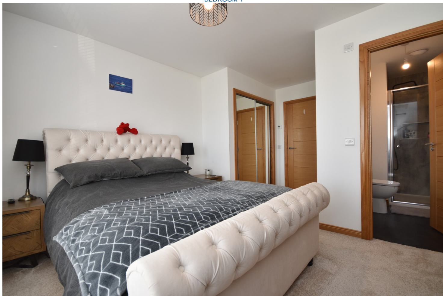
BEDROOM 1 ALTERNATIVE VIEW