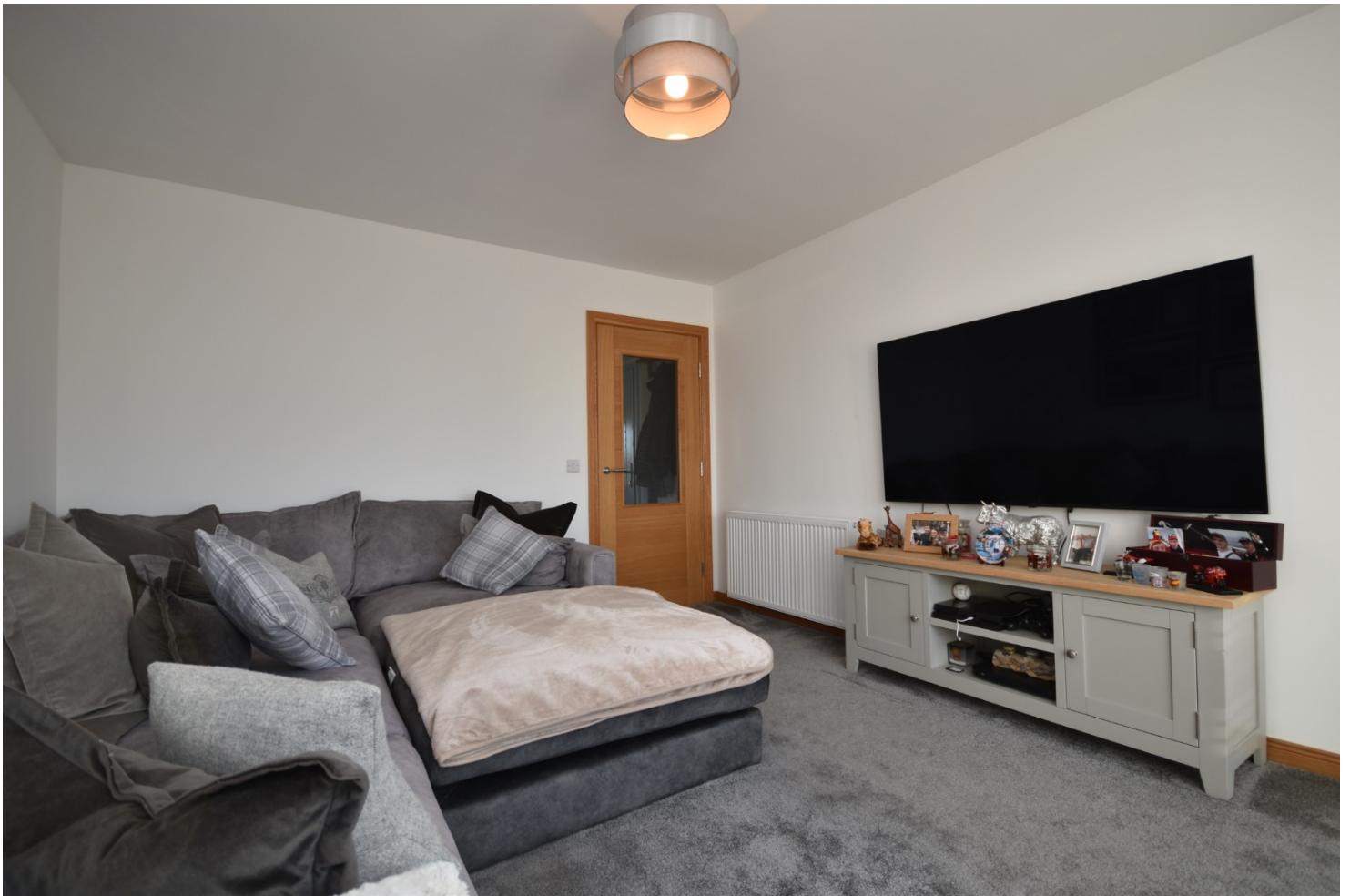
LIVING ROOM ALTERNATIVE VIEW