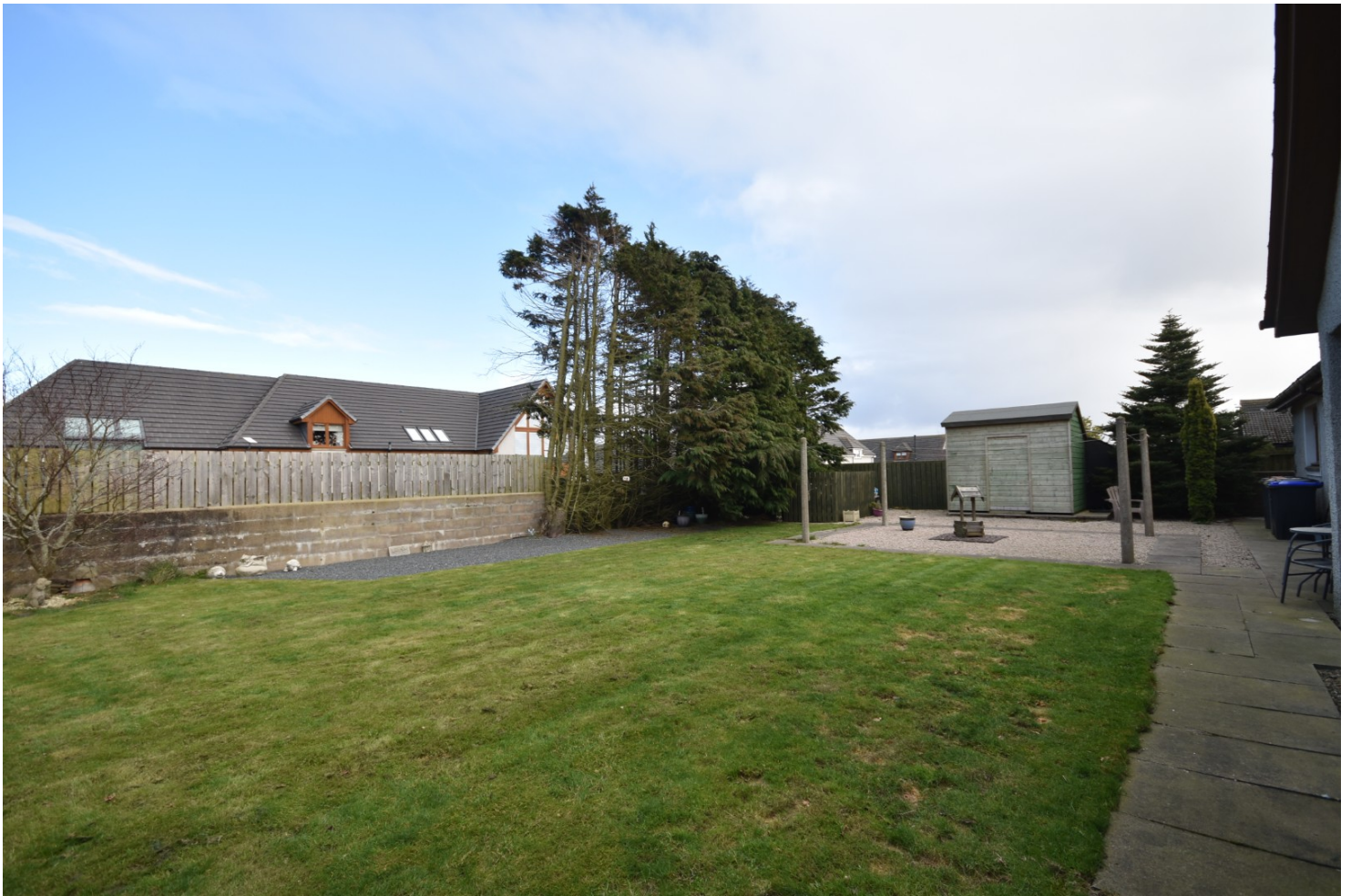
REAR GARDEN ALTERNATIVE VIEW