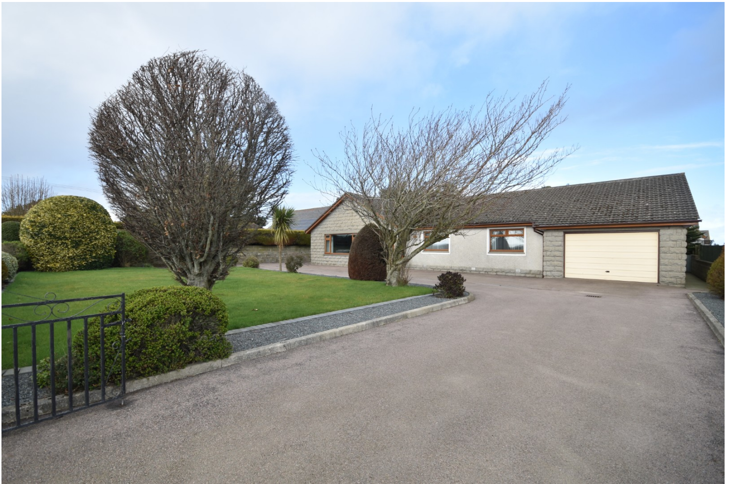
FRONT ALTERNATIVE VIEW