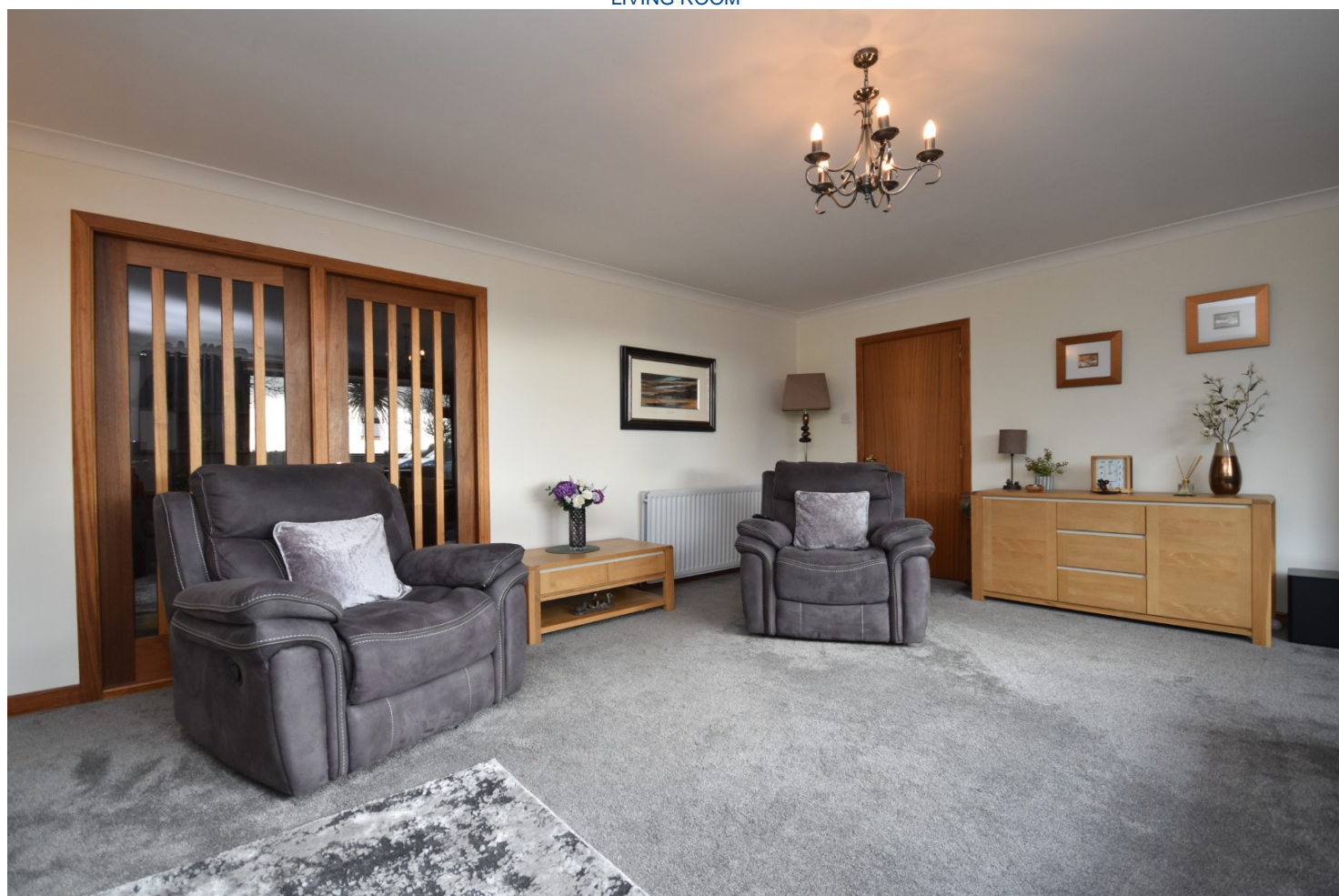
LIVING ROOM ALTERNATIVE VIEW