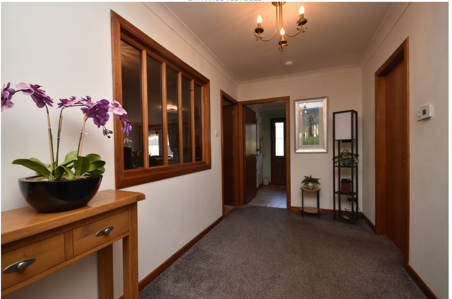
HALLWAY ALTERNATIVE VIEW