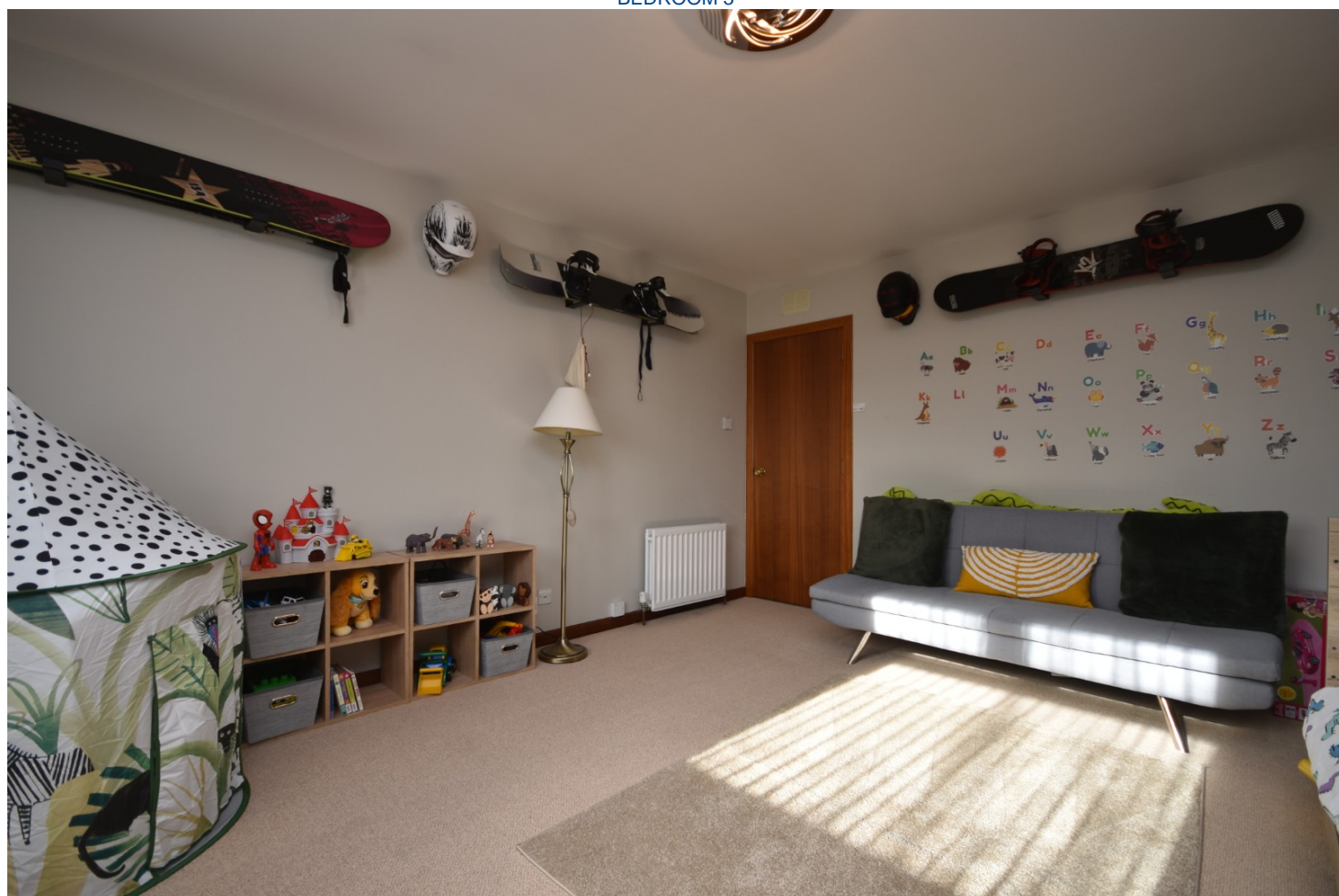
BEDROOM 3 ALTERNATIVE VIEW