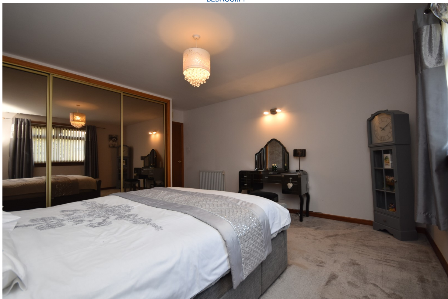
BEDROOM 1 ALTERNATIVE VIEW