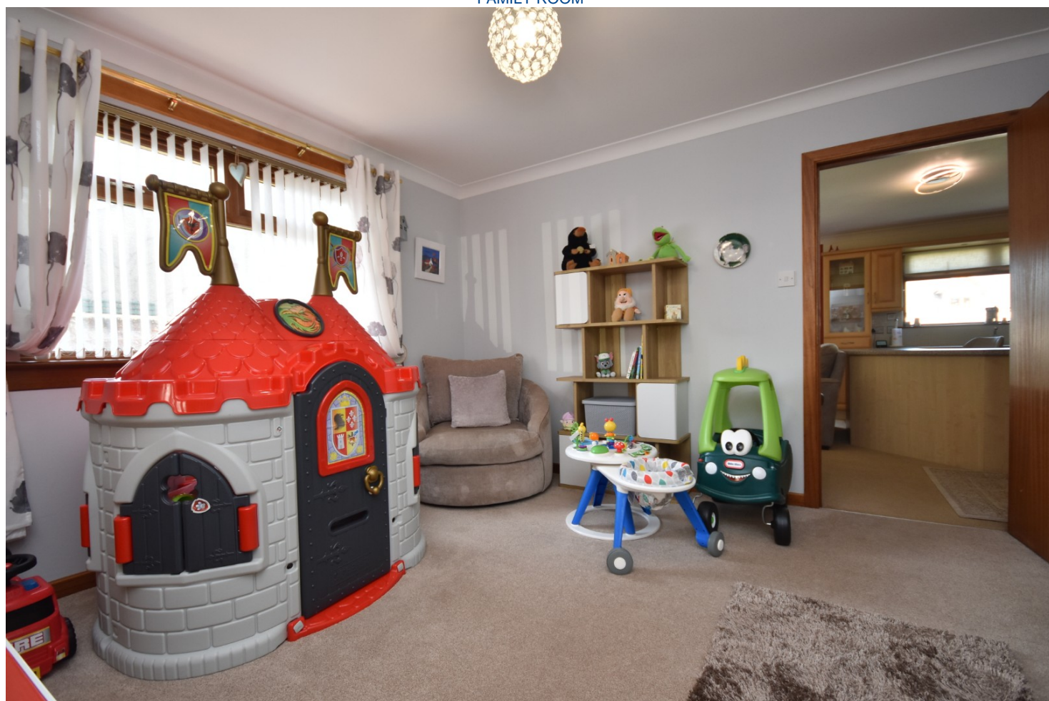
FAMILY ROOM ALTERNATIVE VIEW