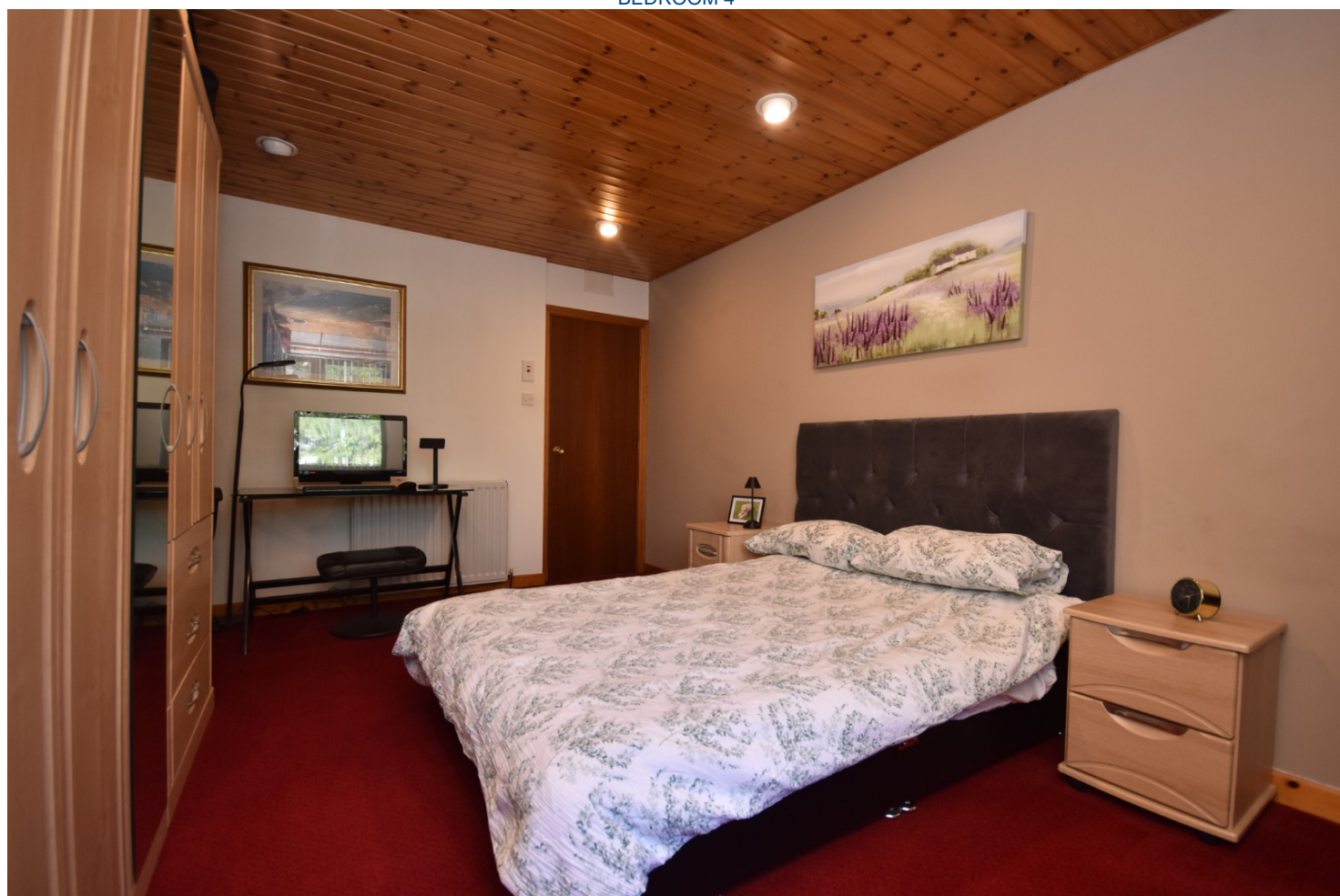
BEDROOM 4 ALTERNATIVE VIEW