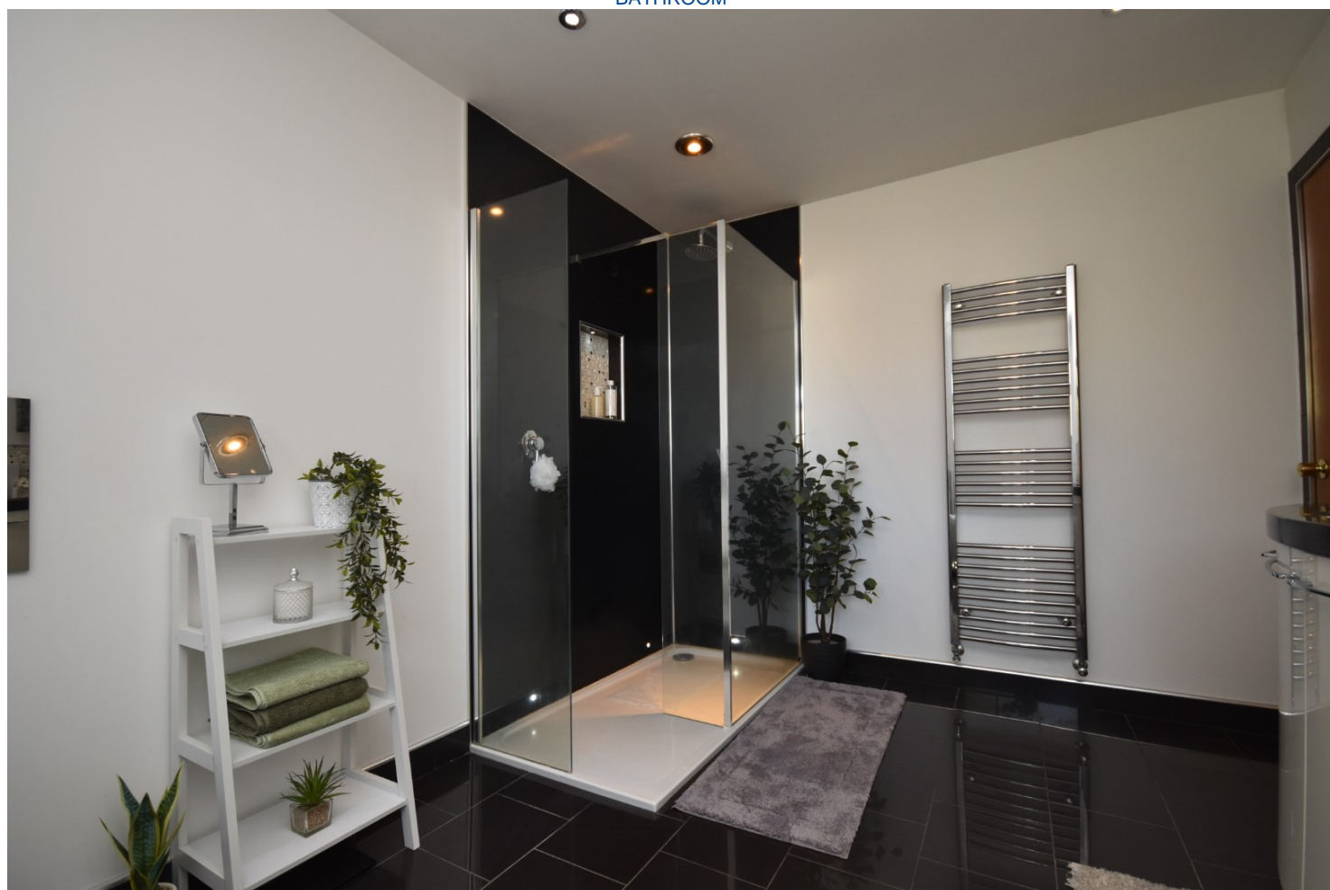
BATHROOM ALTERNATIVE VIEW