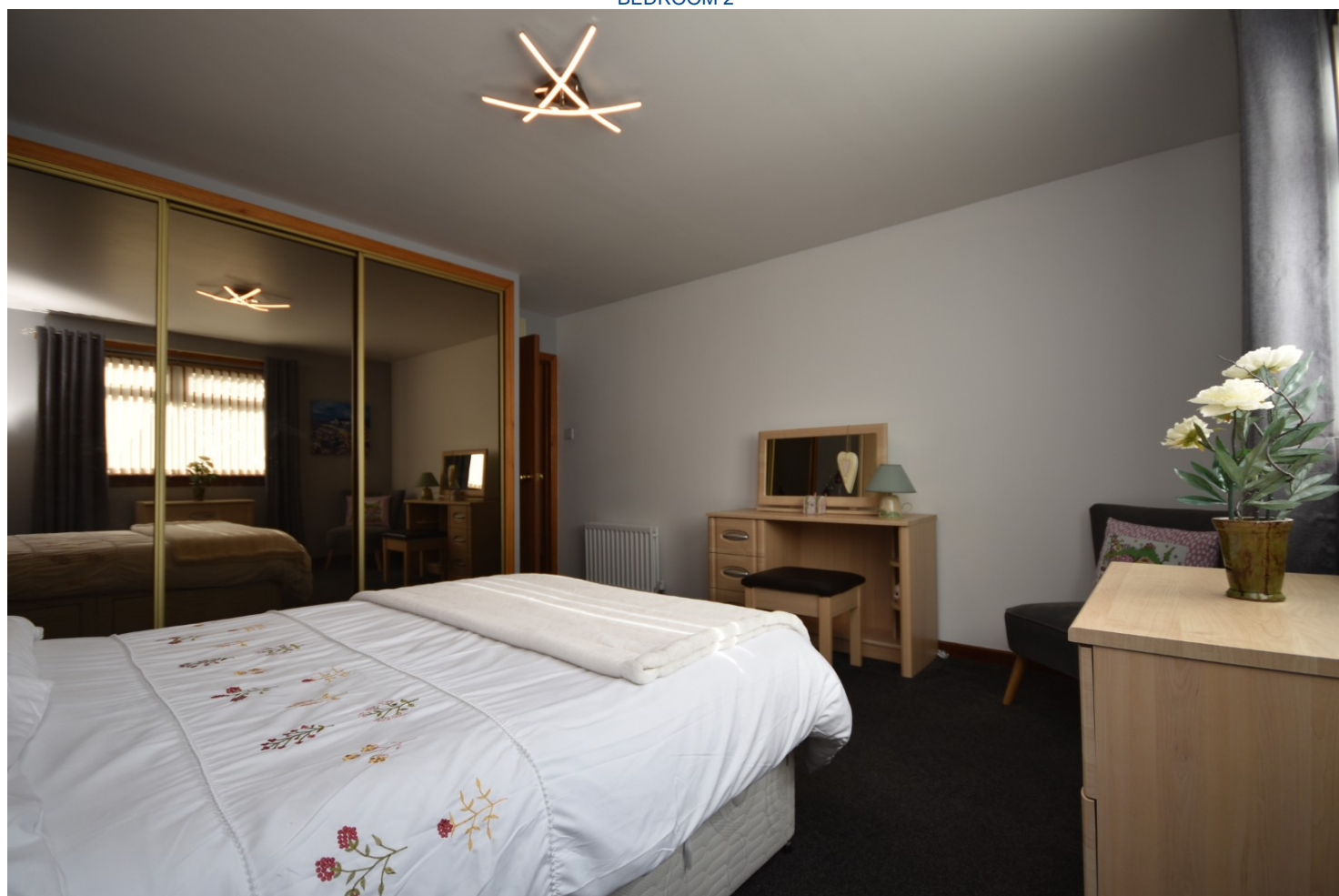
BEDROOM 2 ALTERNATIVE VIEW