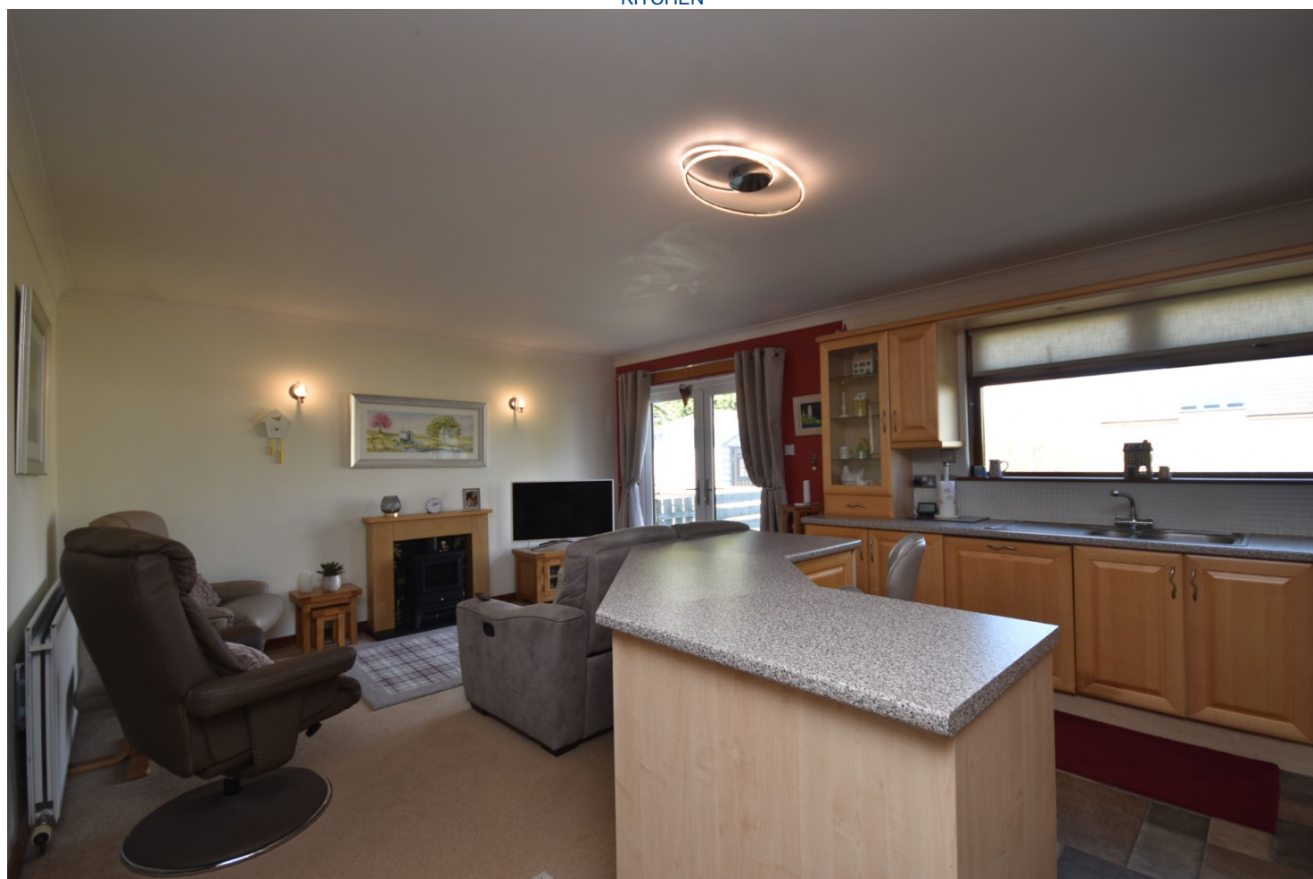
KITCHEN FAMILY AREA