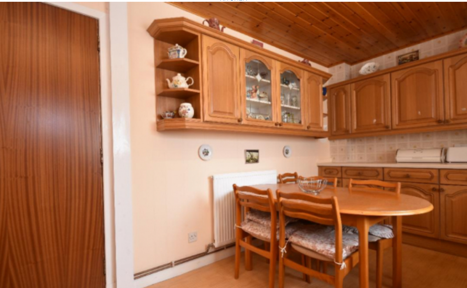
KITCHEN ALTERNATIVE VIEW