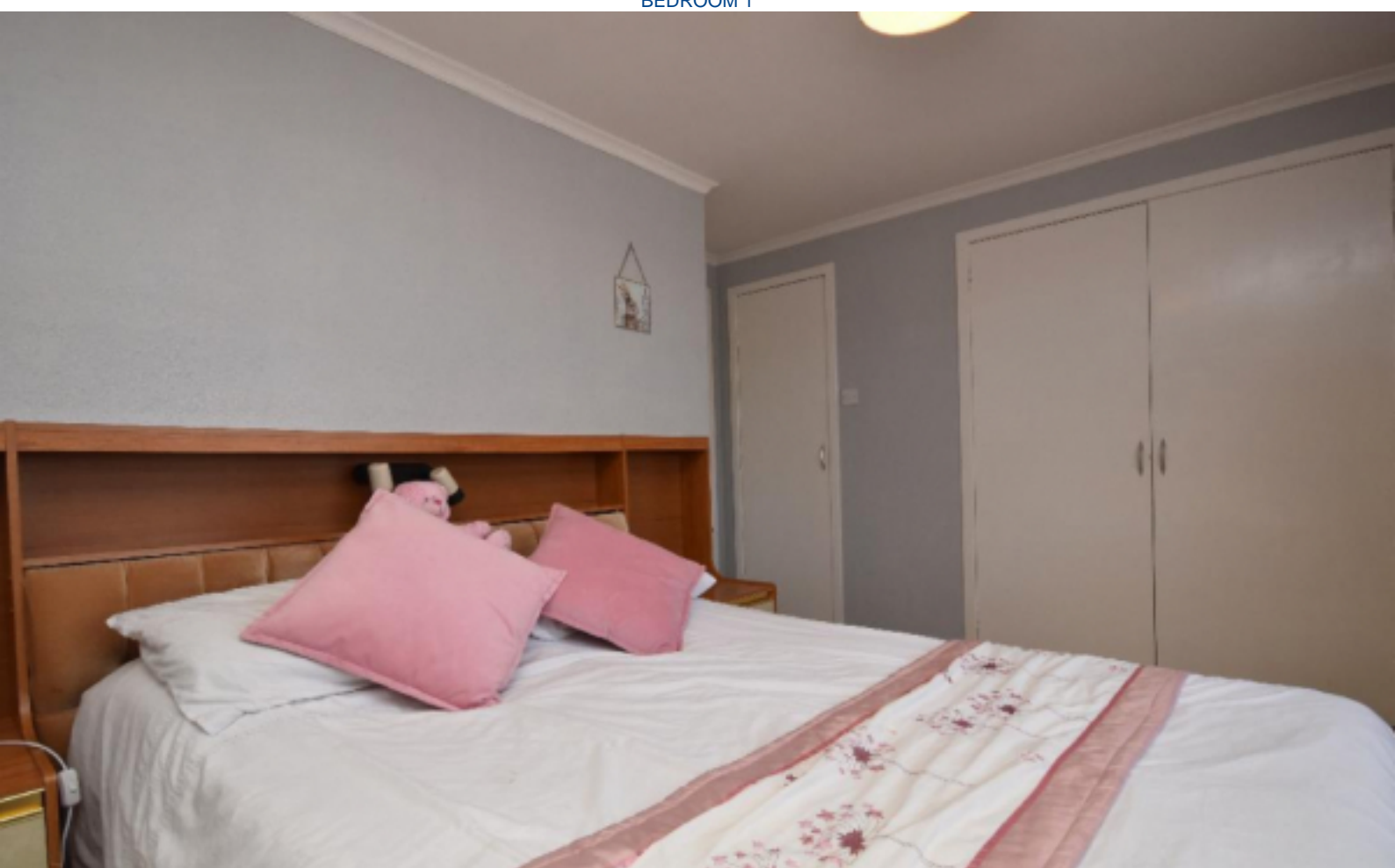
BEDROOM 1 ALTERNATIVE VIEW