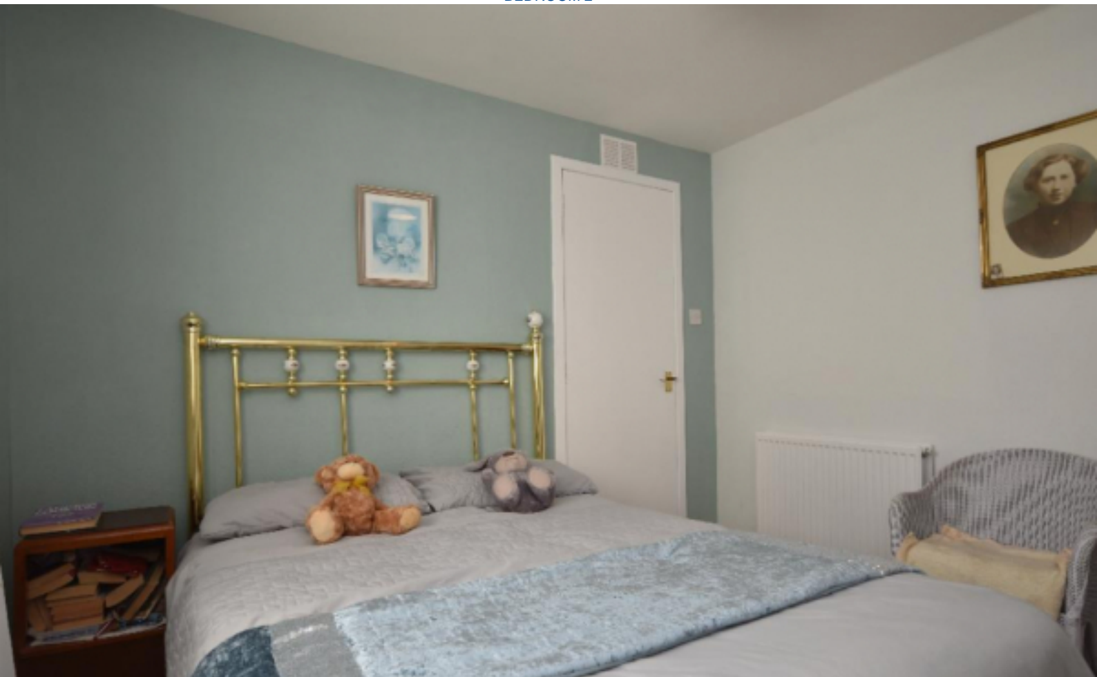
BEDROOM 2 ALTERNATIVE VIEW