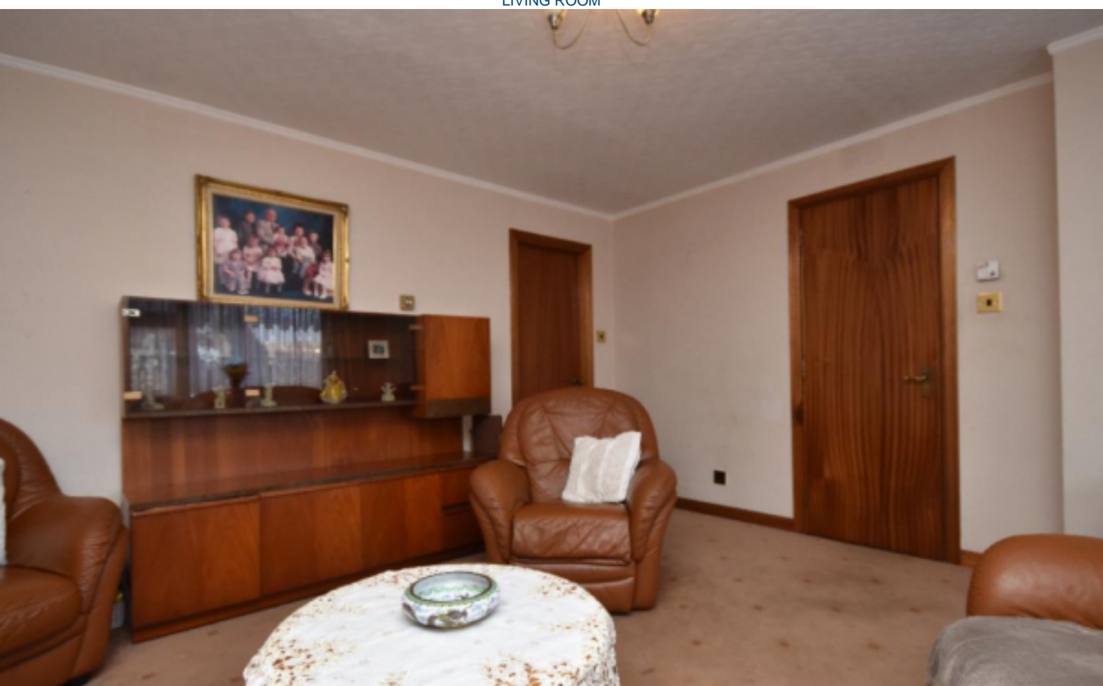
LIVING ROOM ALTERNATIVE VIEW