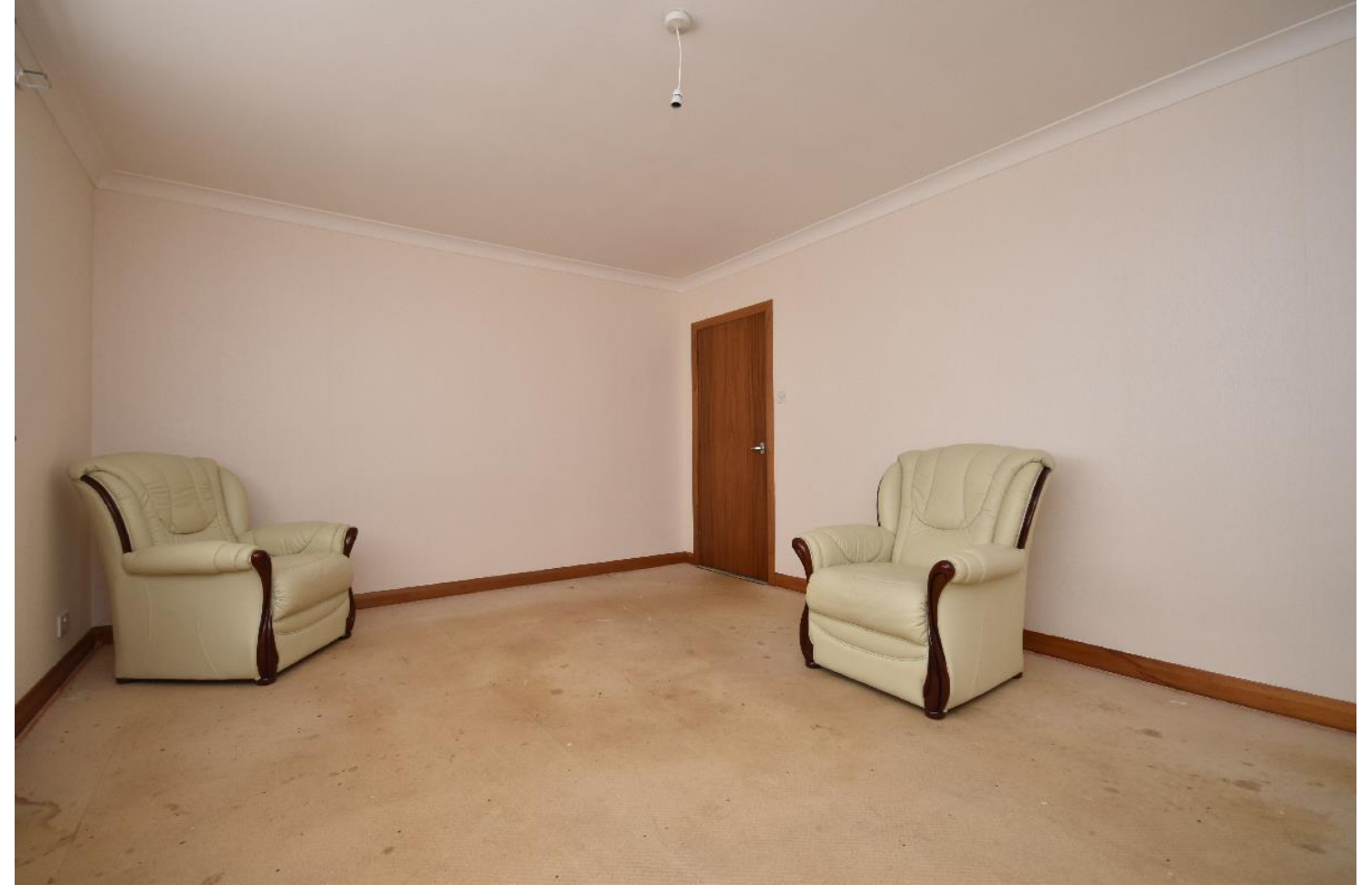
LIVING ROOM ALTERNATIVE VIEW