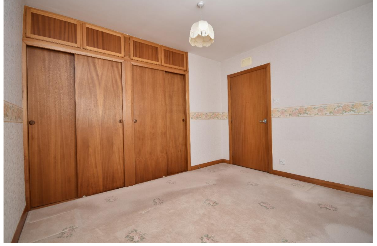
BEDROOM 2 ALTERNATIVE VIEW