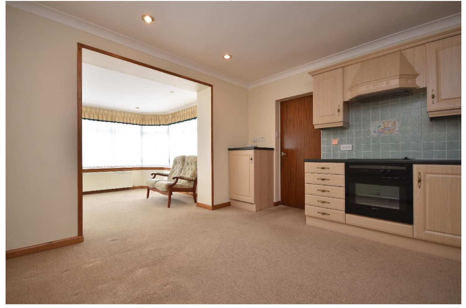
KITCHEN ALTERNATIVE VIEW