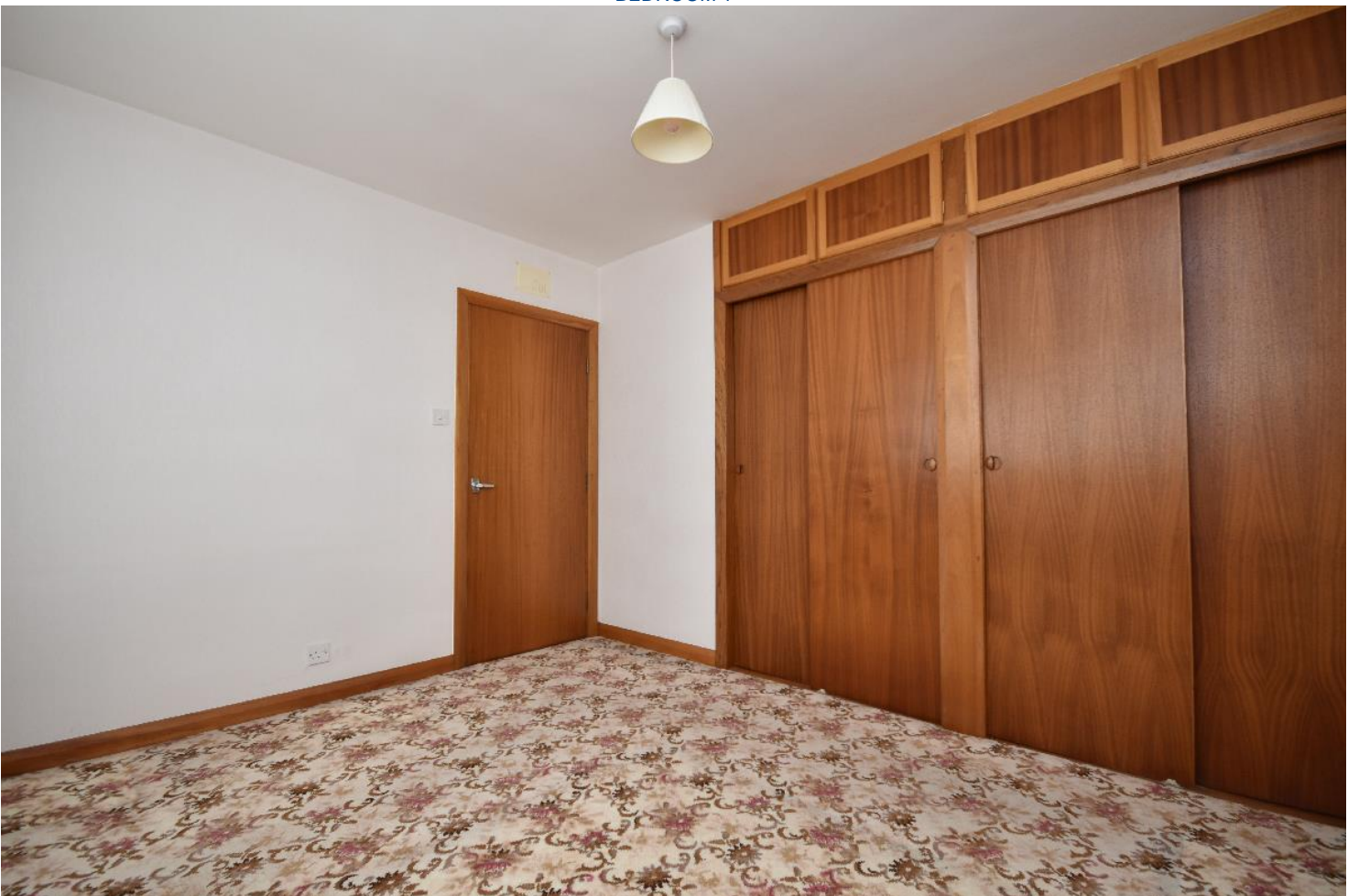
BEDROOM 1 ALTERNATIVE VIEW