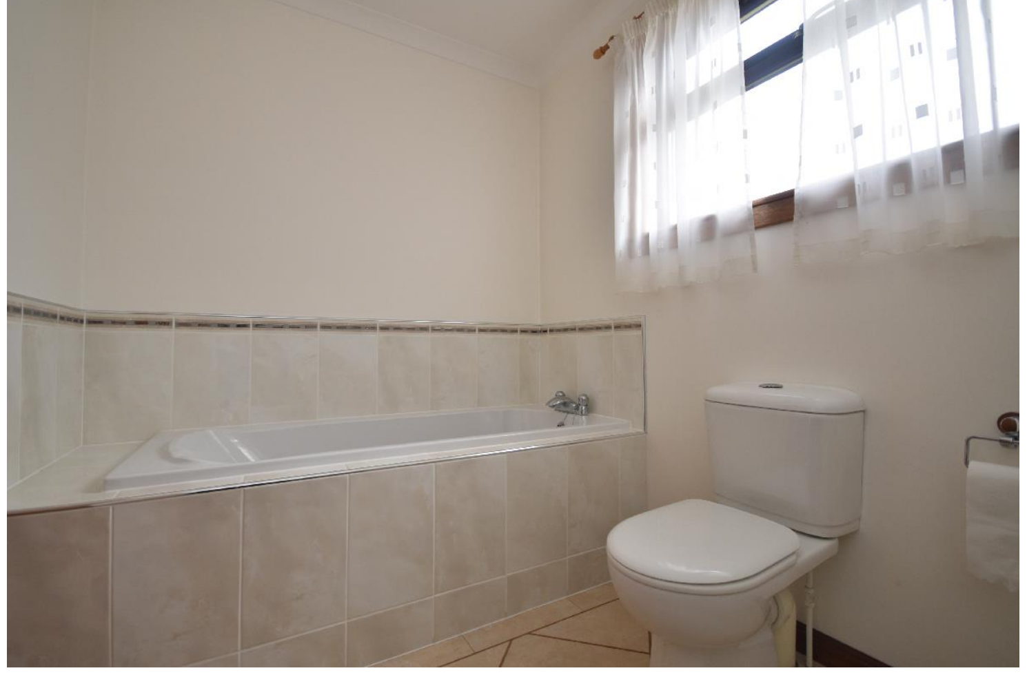
BATHROOM ALTERNATIVE VIEW