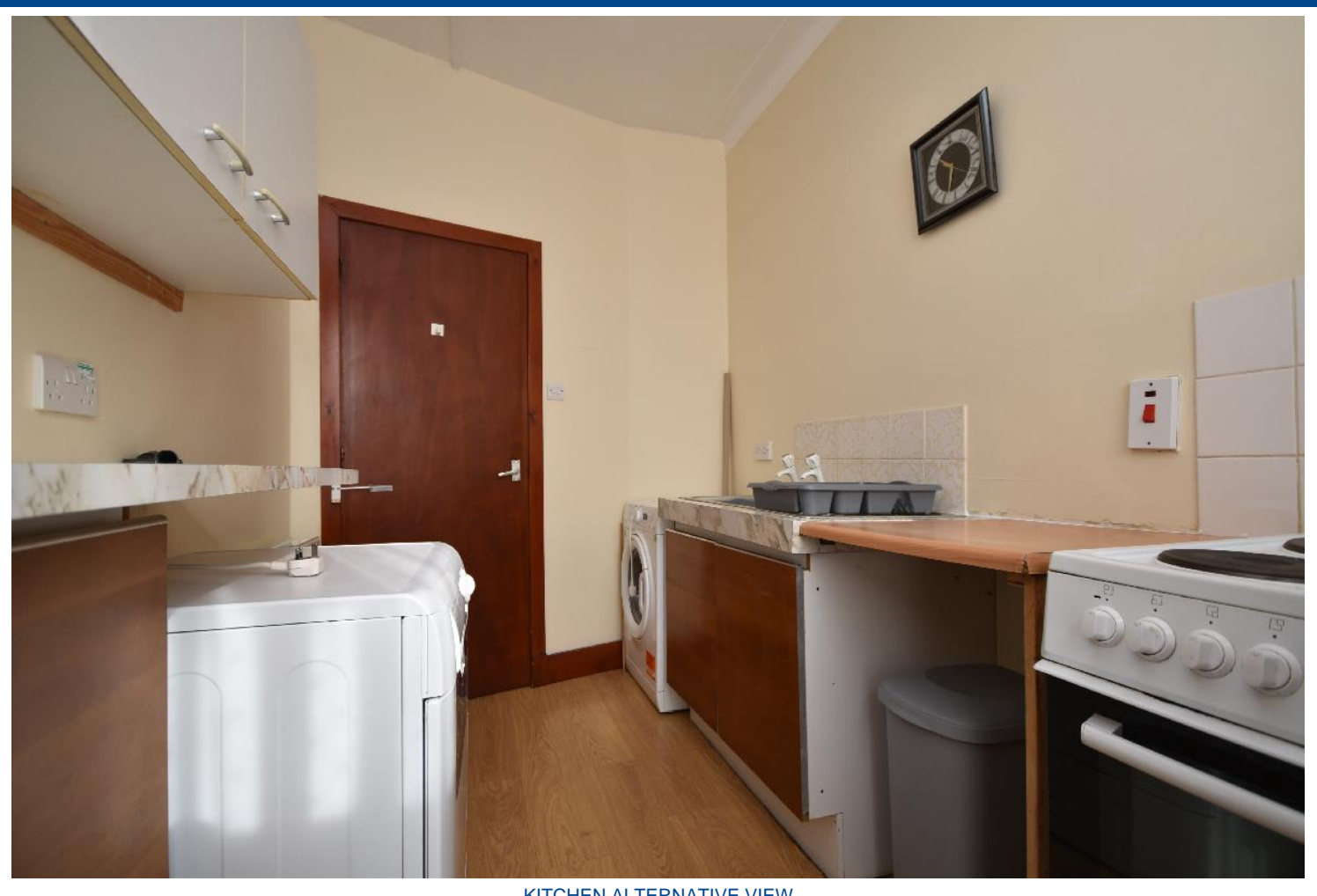
KITCHEN ALTERNATIVE VIEW