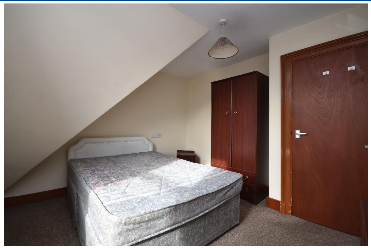
BEDROOM 2 ALTERNATIVE VIEW