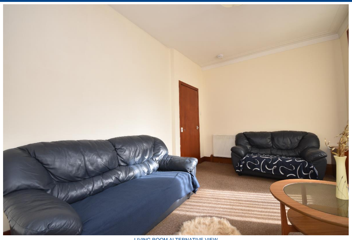
LIVING ROOM ALTERNATIVE VIEW