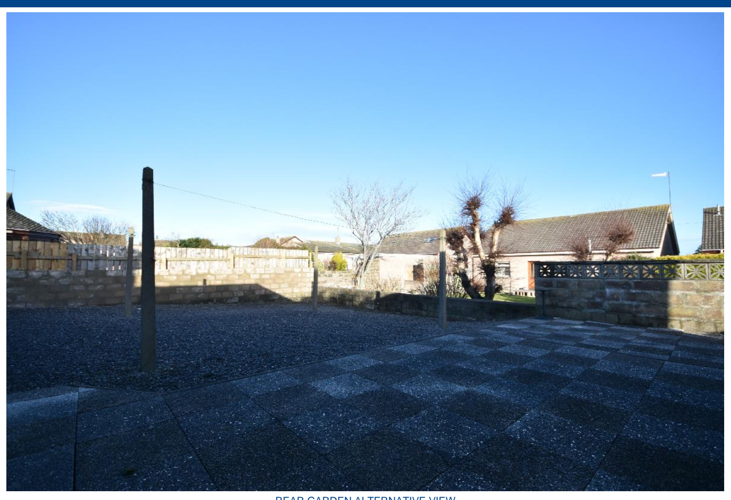
REAR GARDEN ALTERNATIVE VIEW