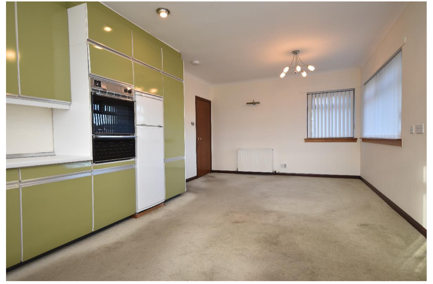
KITCHEN DINING AREA