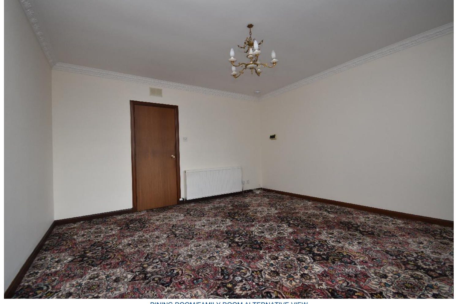
DINING ROOM/FAMILY ROOM ALTERNATIVE VIEW