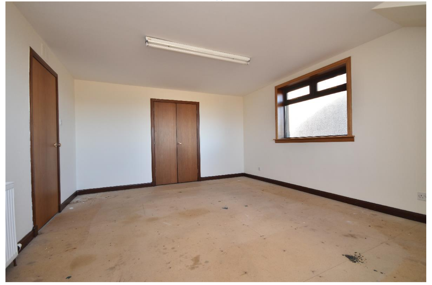
BEDROOM 2 ALTERNATIVE VIEW