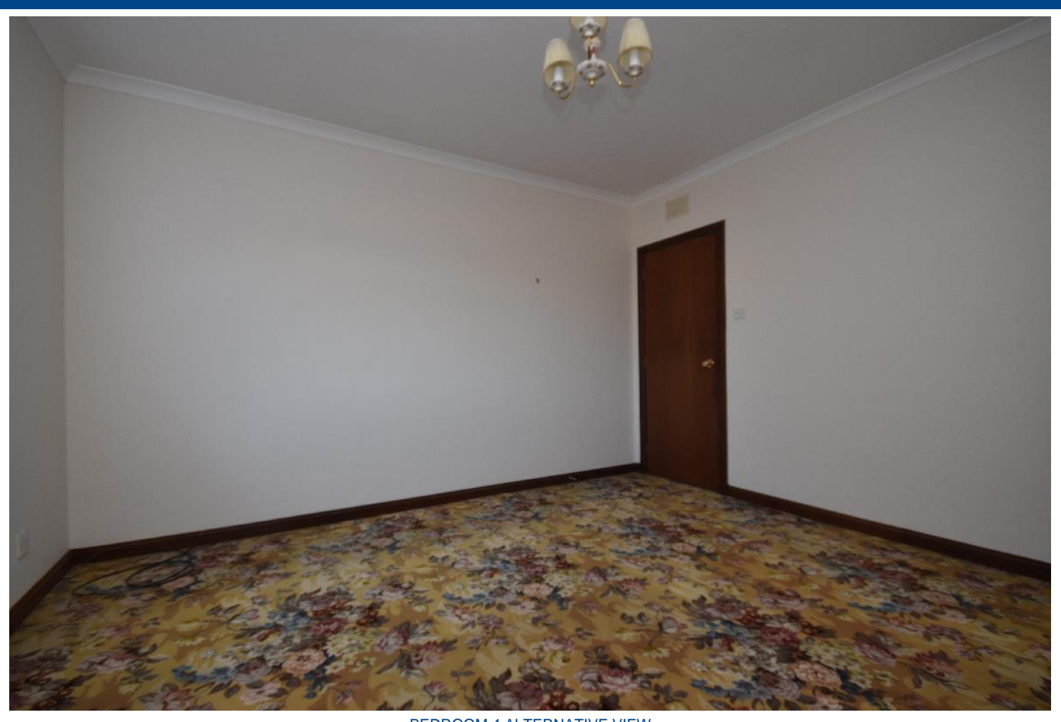
BEDROOM 4 ALTERNATIVE VIEW