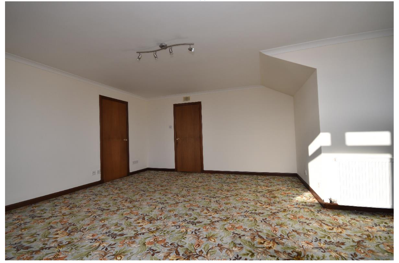
BEDROOM 1 ALTERNATIVE VIEW