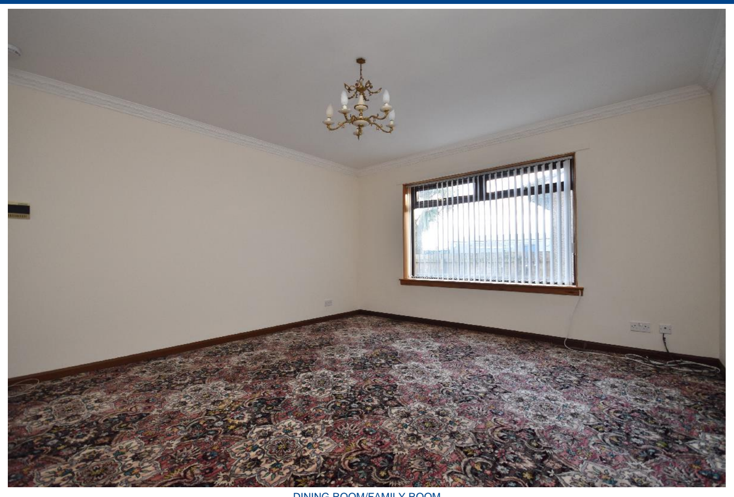
DINING ROOM/FAMILY ROOM