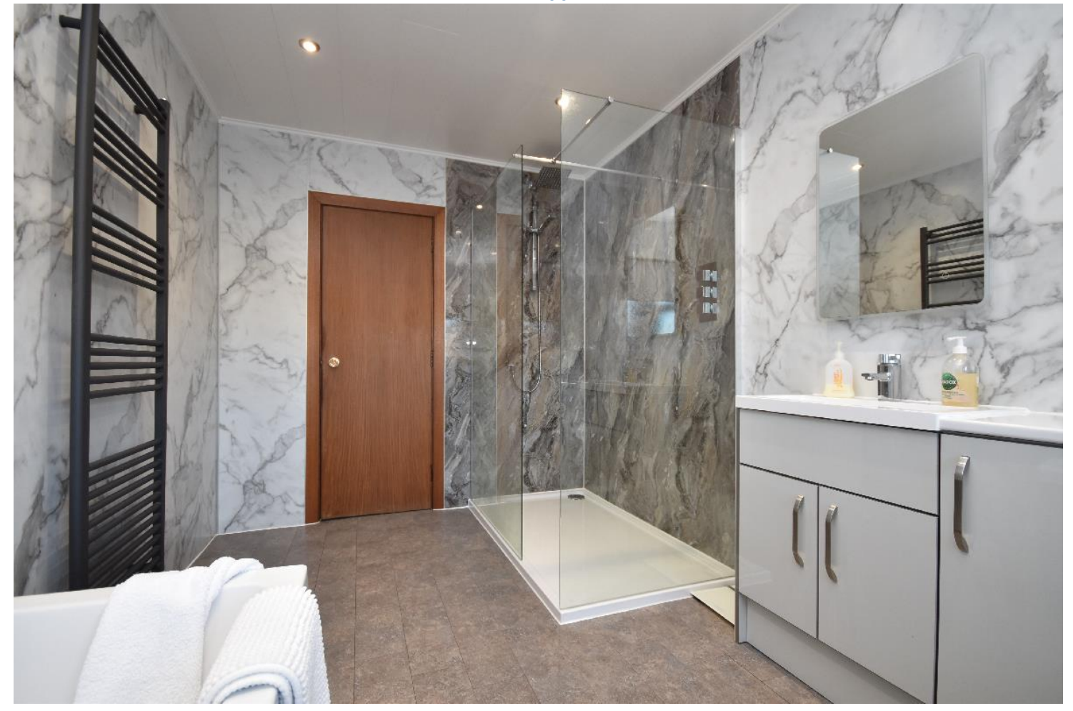
BATHROOM ALTERNATIVE VIEW