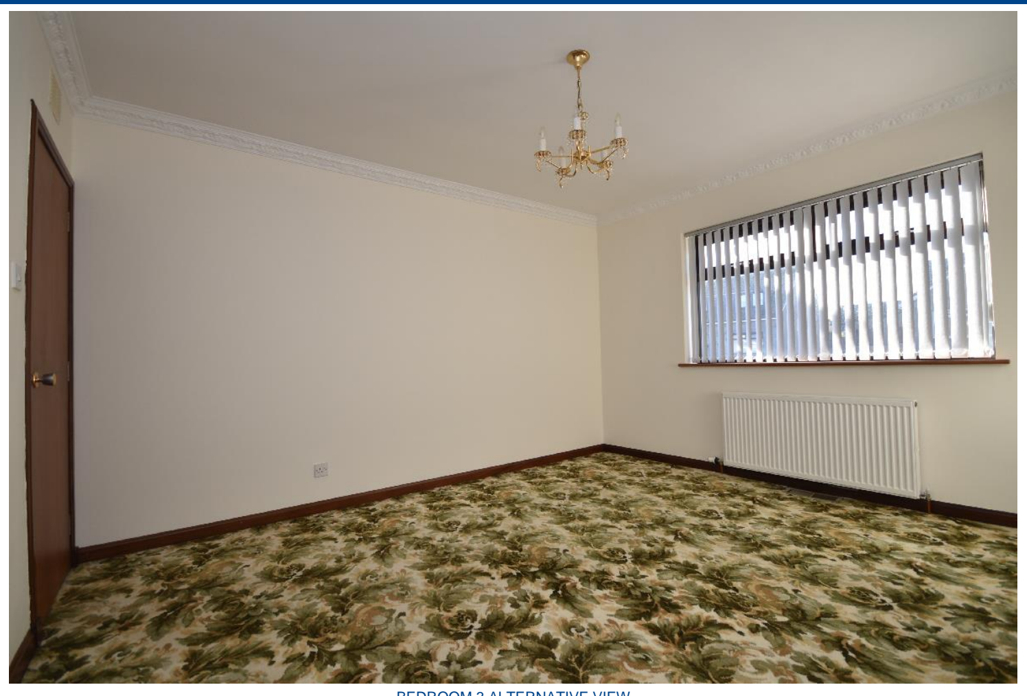
BEDROOM 3 ALTERNATIVE VIEW