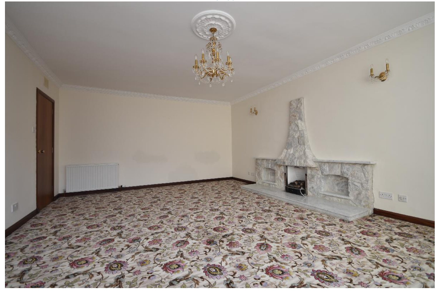
LIVING ROOM ALTERNATIVE VIEW