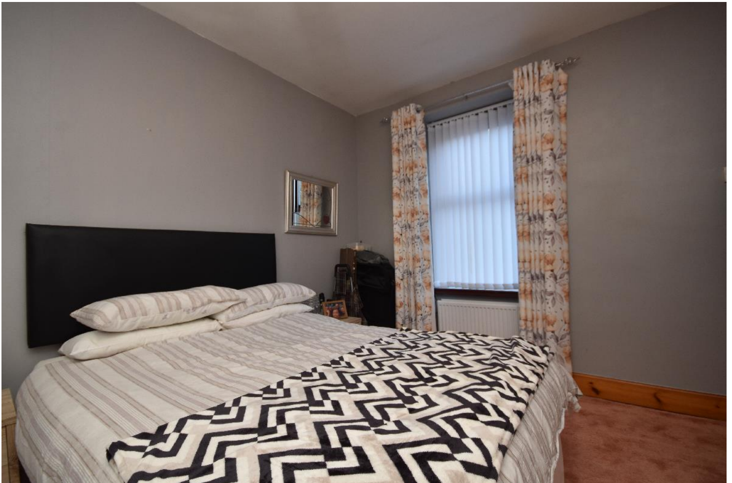
BEDROOM 3 ALTERNATIVE VIEW