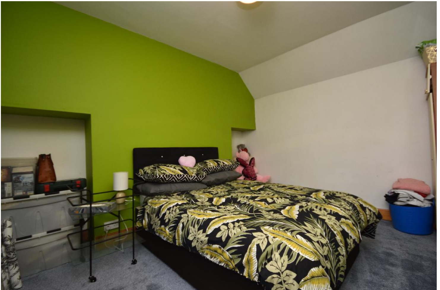
BEDROOM 2 ALTERNATIVE VIEW