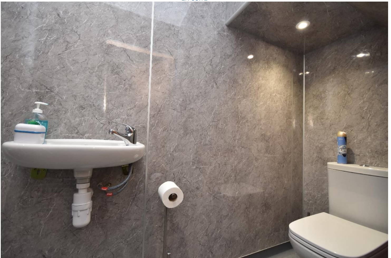
EN-SUITE ALTERNATIVE VIEW