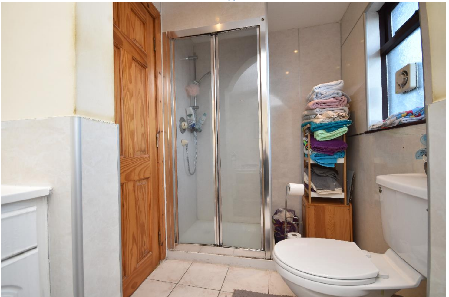
BATHROOM ALTERNATIVE VIEW