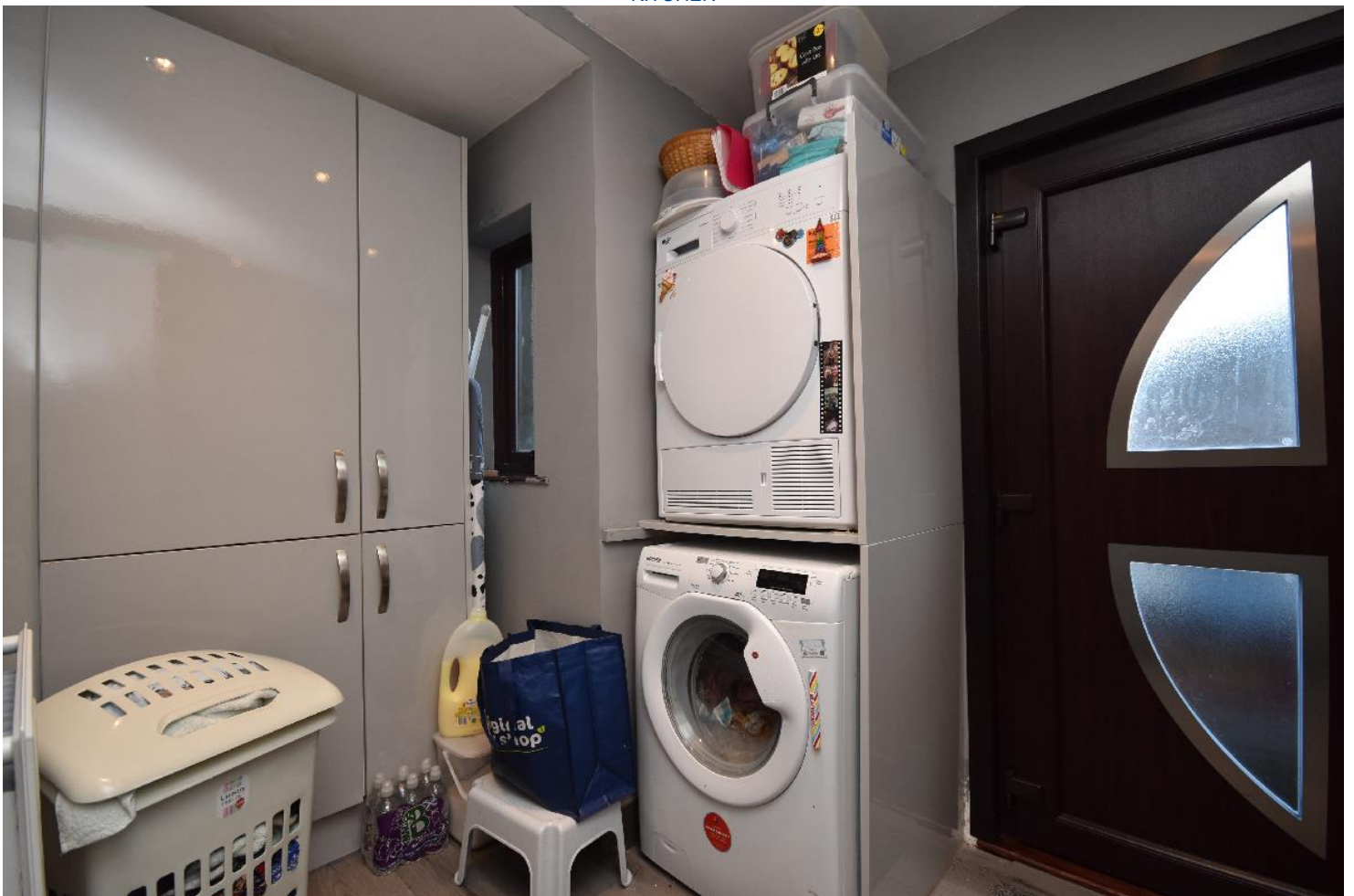
KITCHEN ALTERNATIVE VIEW