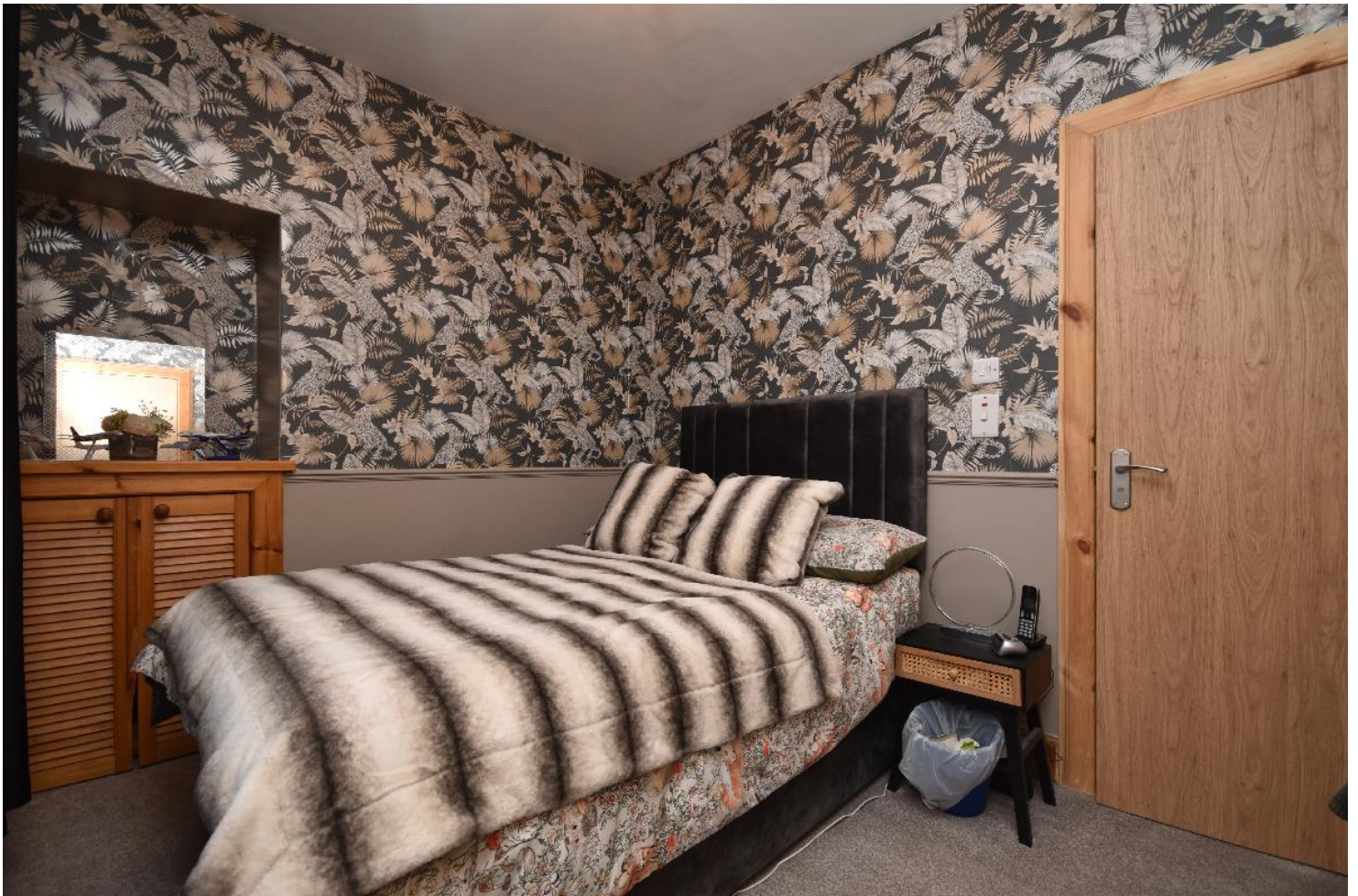
BEDROOM 1 ALTERNATIVE VIEW