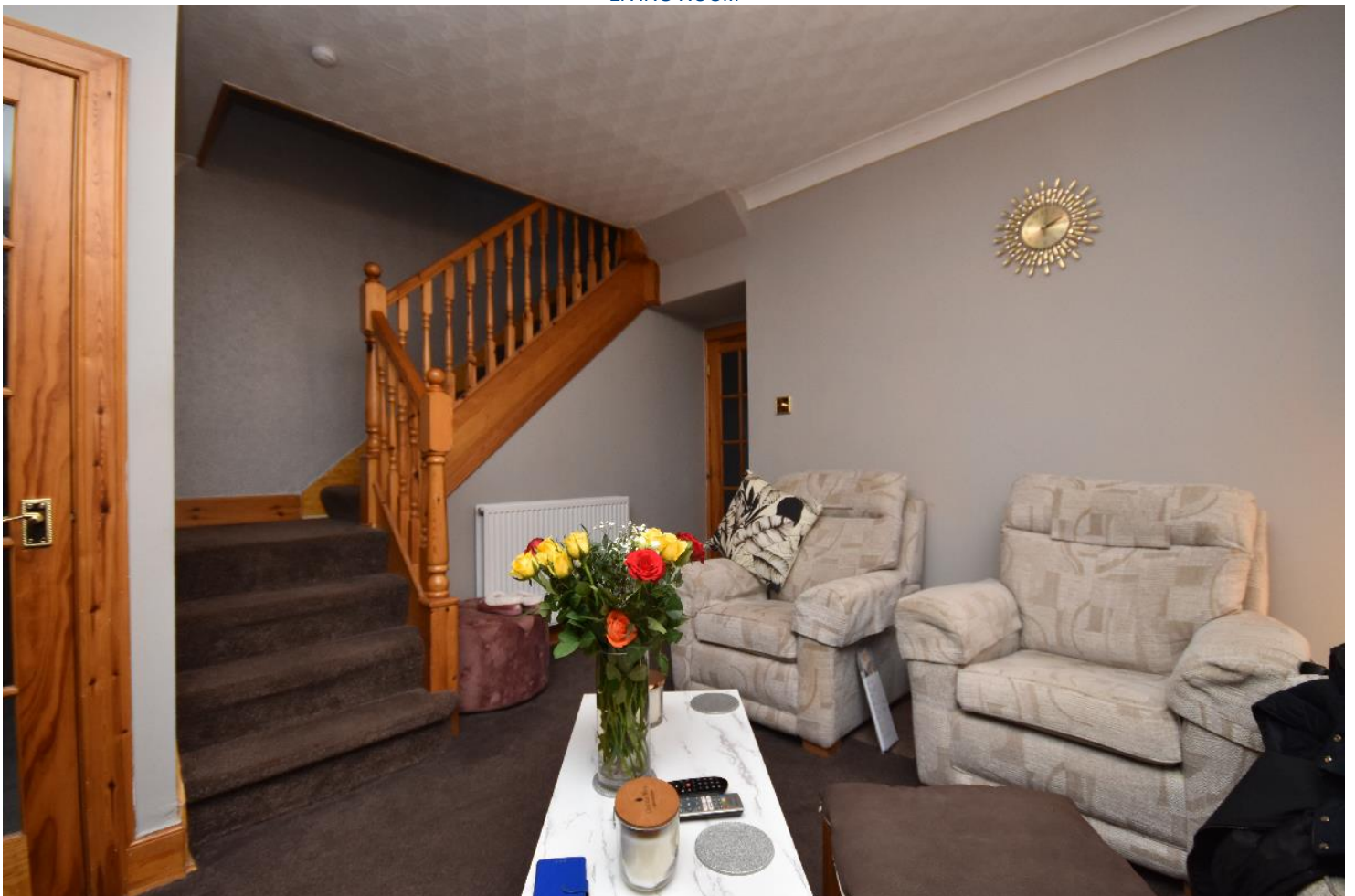
LIVING ROOM ALTERNATIVE VIEW