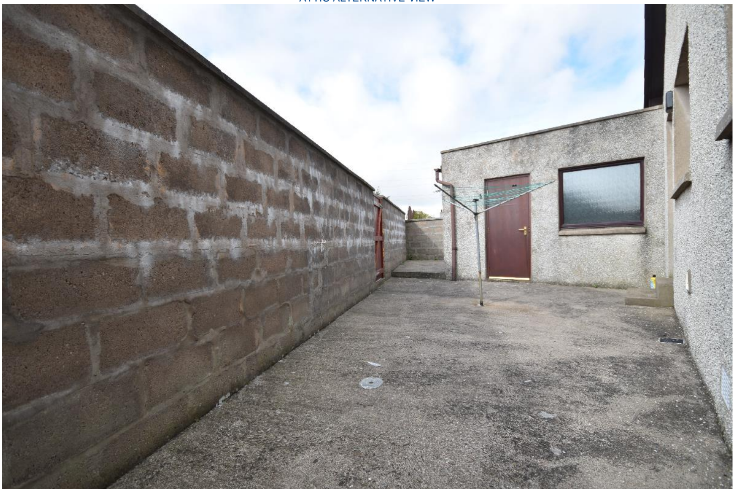
ENCLOSED REAR COURTYARD