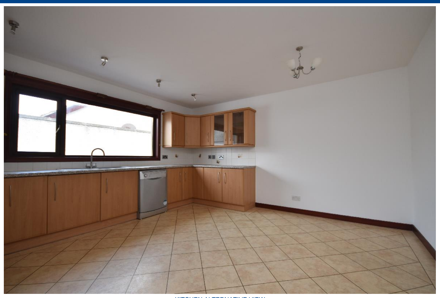
KITCHEN ALTERNATIVE VIEW