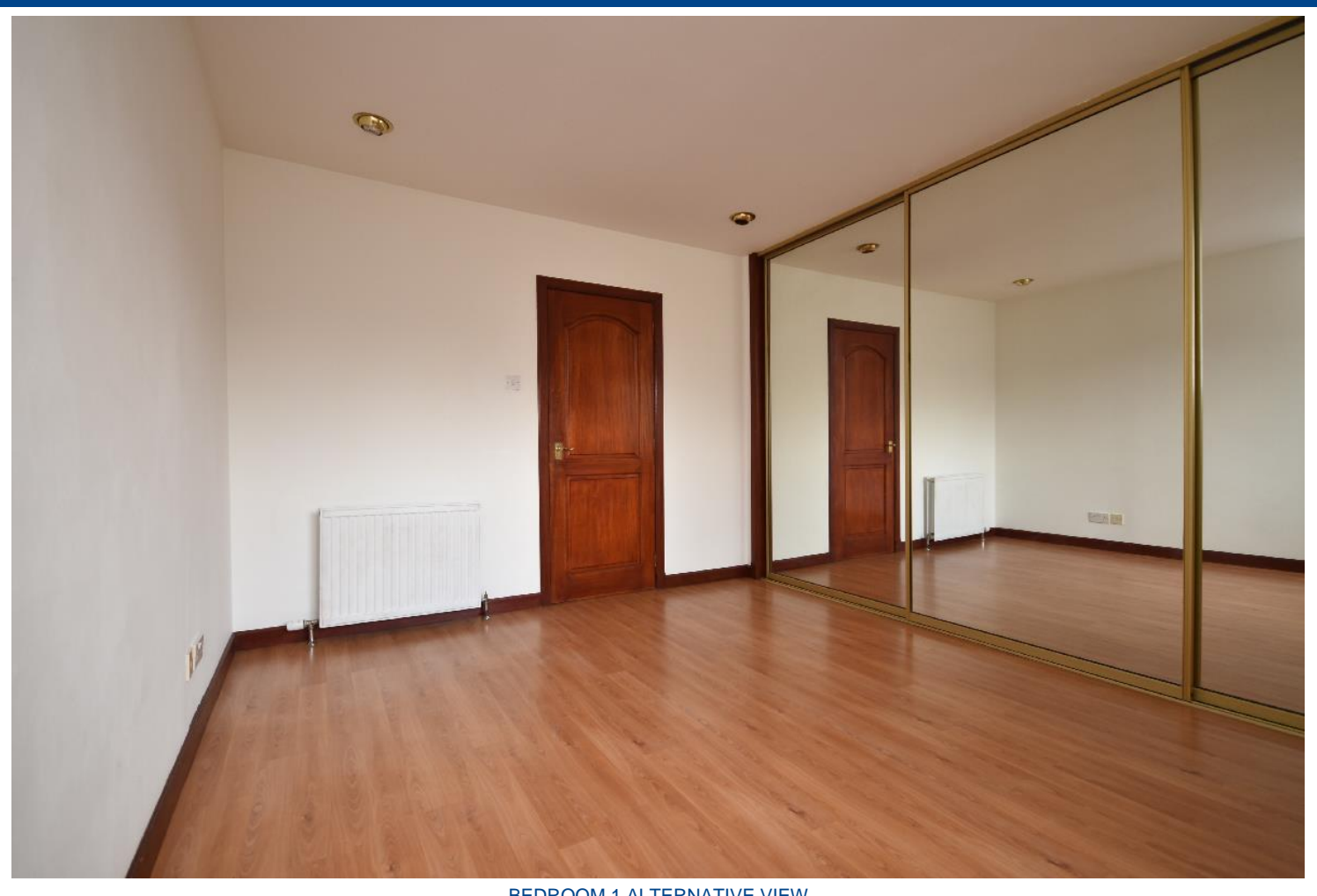
BEDROOM 1 ALTERNATIVE VIEW