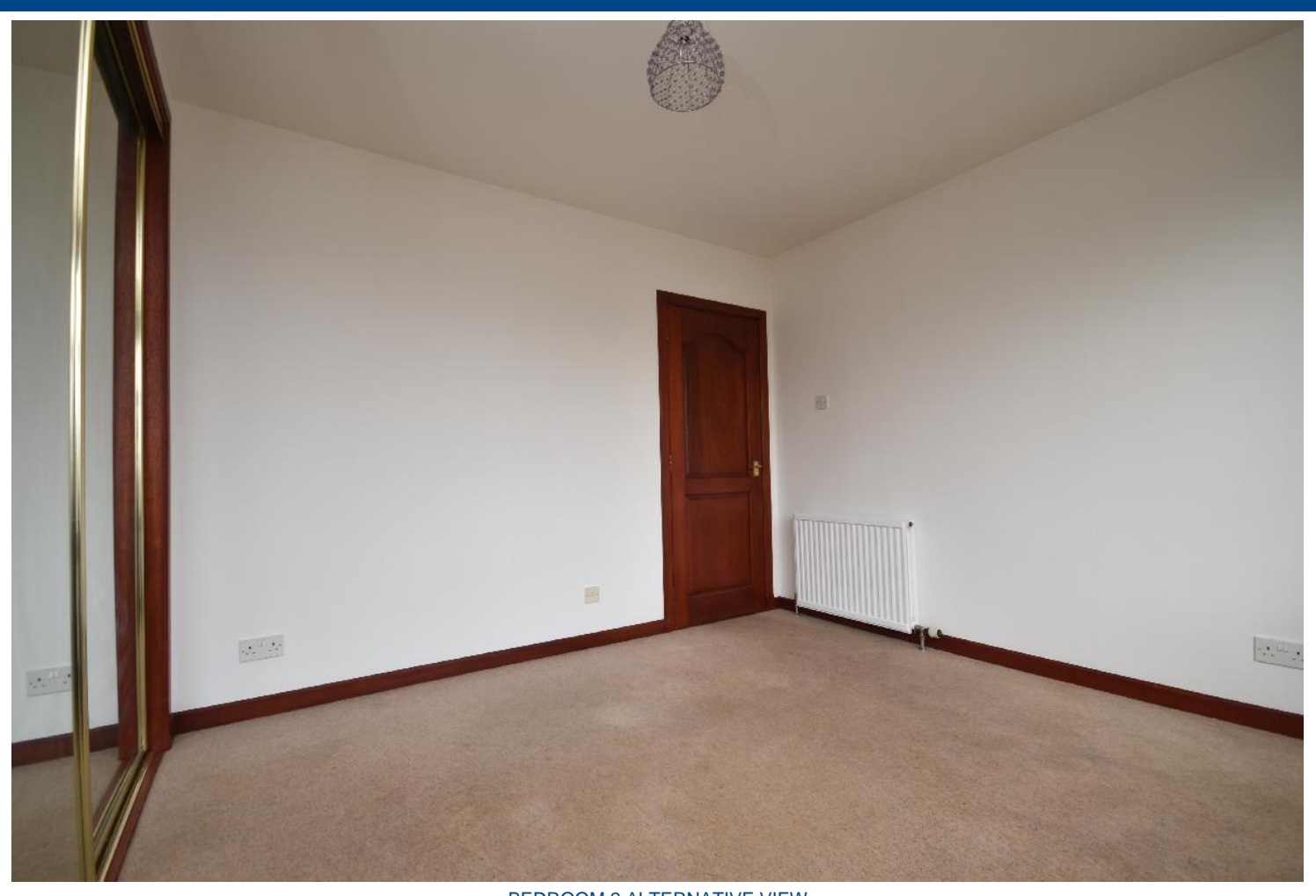
BEDROOM 2 ALTERNATIVE VIEW