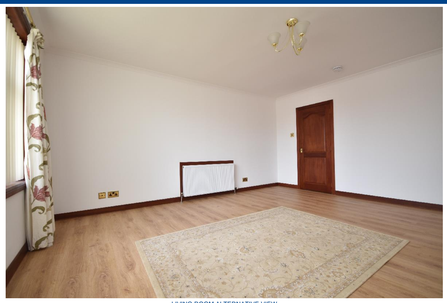
LIVING ROOM ALTERNATIVE VIEW