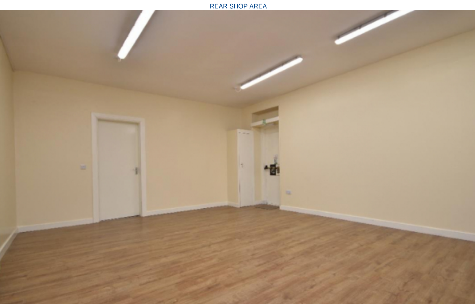
REAR SHOP AREA ALTERNATIVE VIEW