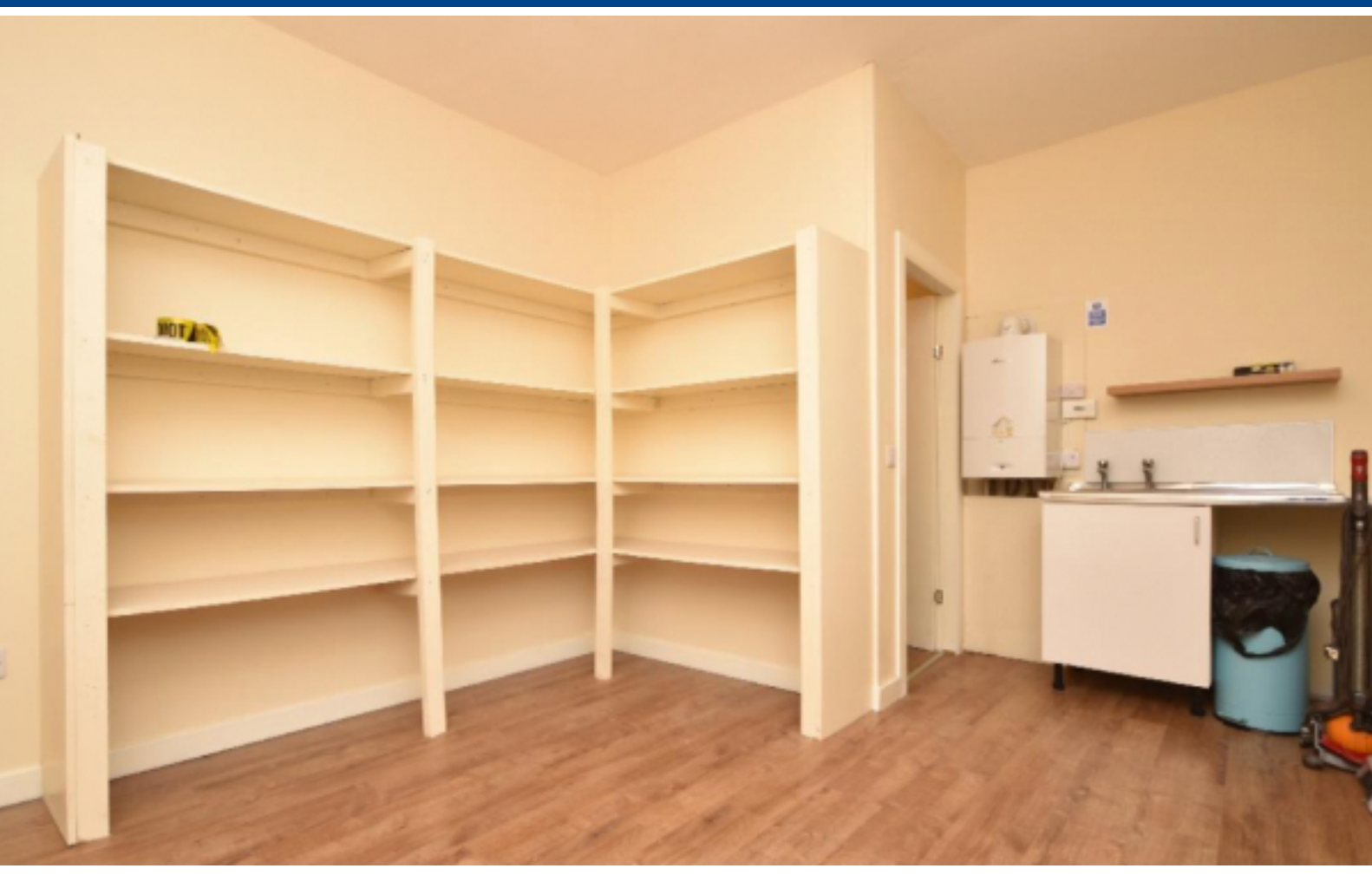
REAR STORE AND KITCHEN