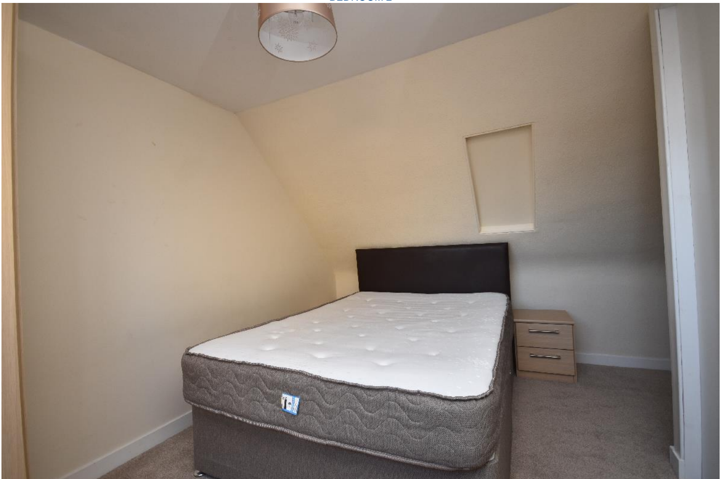
BEDROOM 2 ALTERNATIVE VIEW