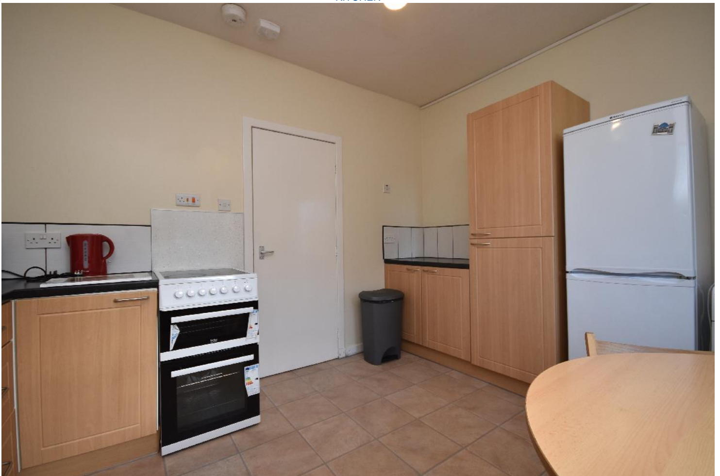
KITCHEN ALTERNATIVE VIEW