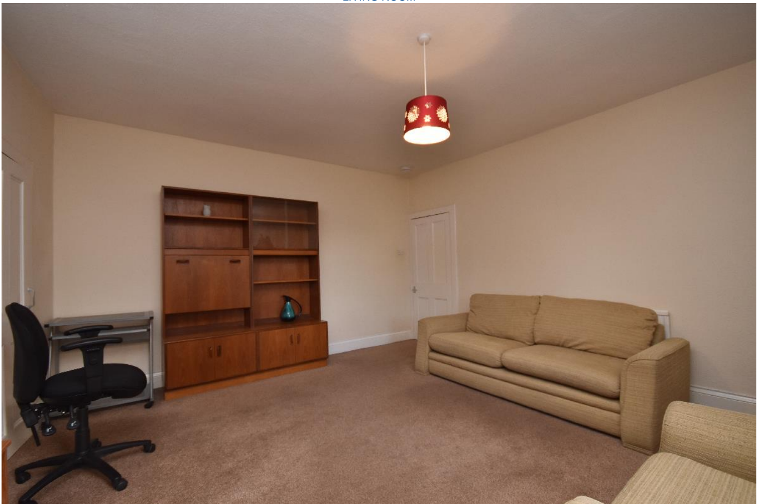
LIVING ROOM ALTERNATIVE VIEW