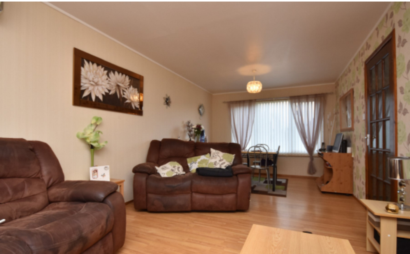
LIVING ROOM ALTERNATIVE VIEW