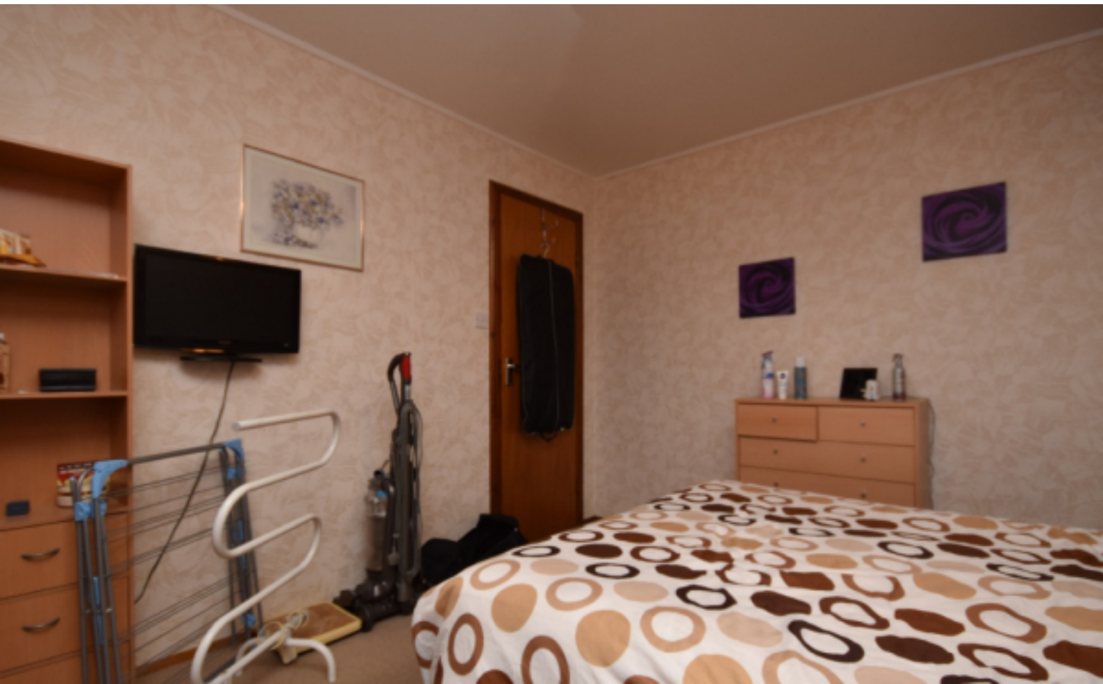
BEDROOM 1 ALTERNATIVE VIEW