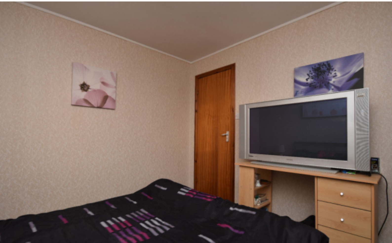
BEDROOM 2 ALTERNATIVE VIEW