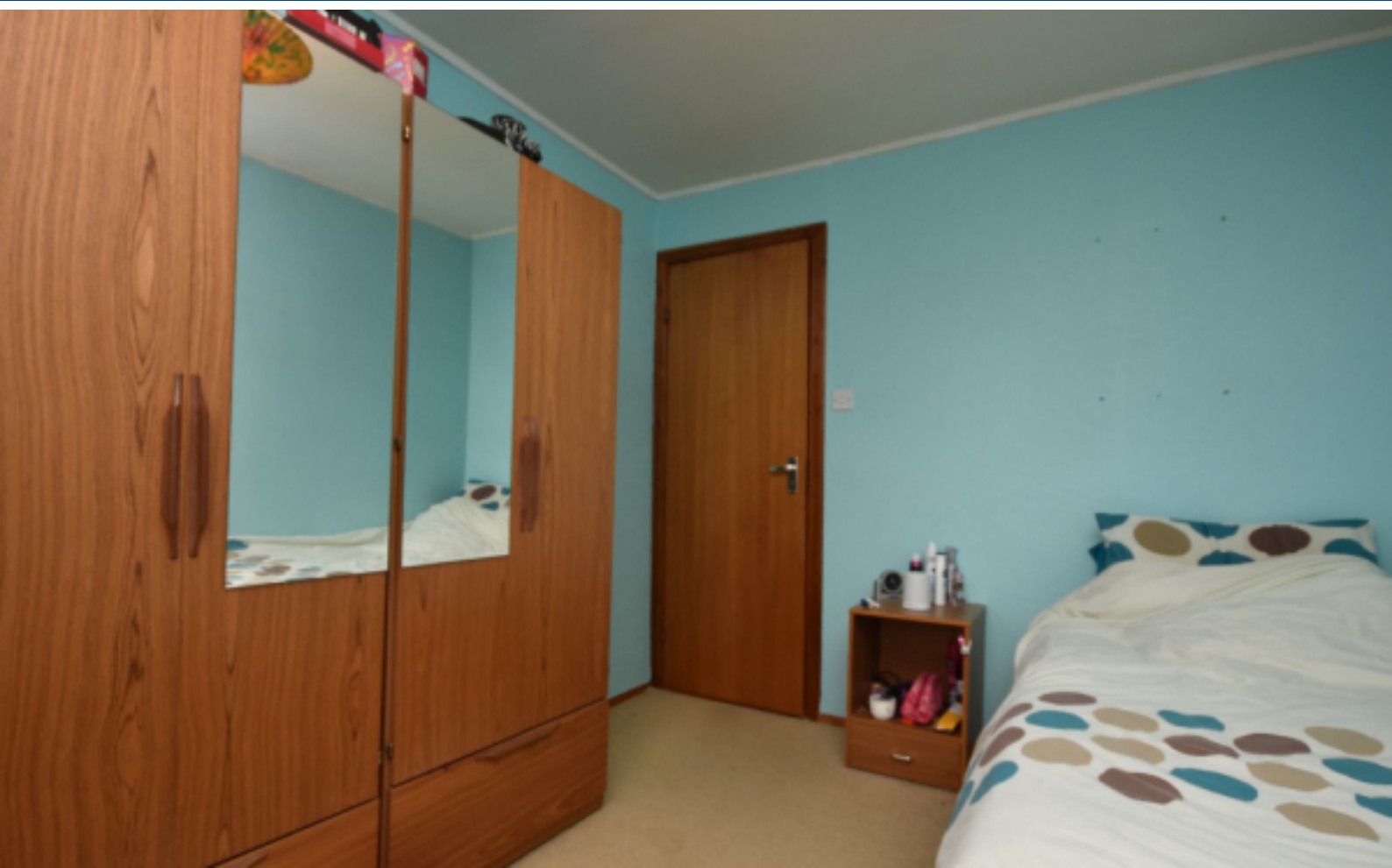
BEDROOM 3 ALTERNATIVE VIEW