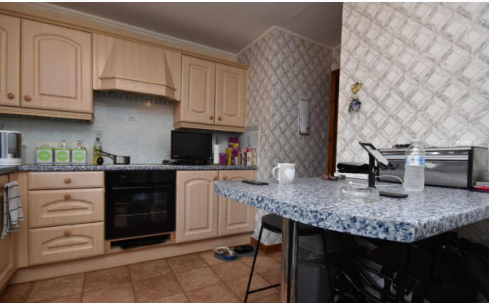
KITCHEN ALTERNATIVE VIEW