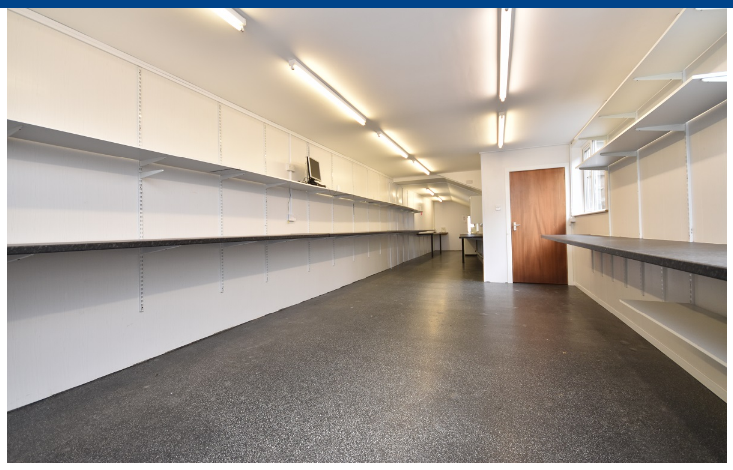
MAIN WORK AREA ALTERNATIVE VIEW