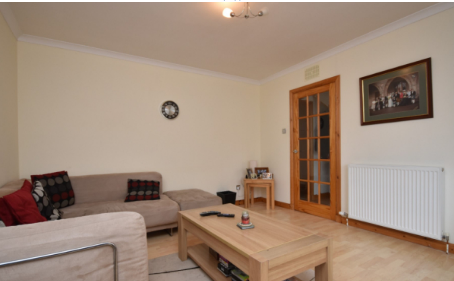
LIVING ROOM ALT